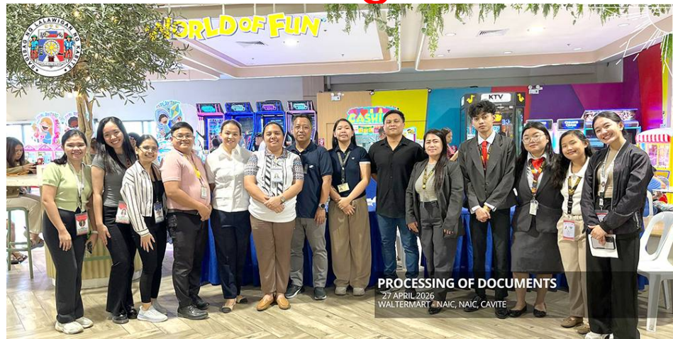
PROCESSING OF DOCUMENTS 27 APRIL 2026 WALTERMART NAIC, NAIC, CAVITE

In its continued effort to make services more accessible and convenient to Caviteños, the Office of the Provincial Public Employment Service Manager (OPPESM) successfully conducted a one-day document processing initiative in partnership with the Social Security System (SSS) and the Bureau of Internal Revenue (BIR) on April 27, at Waltermart Naic.