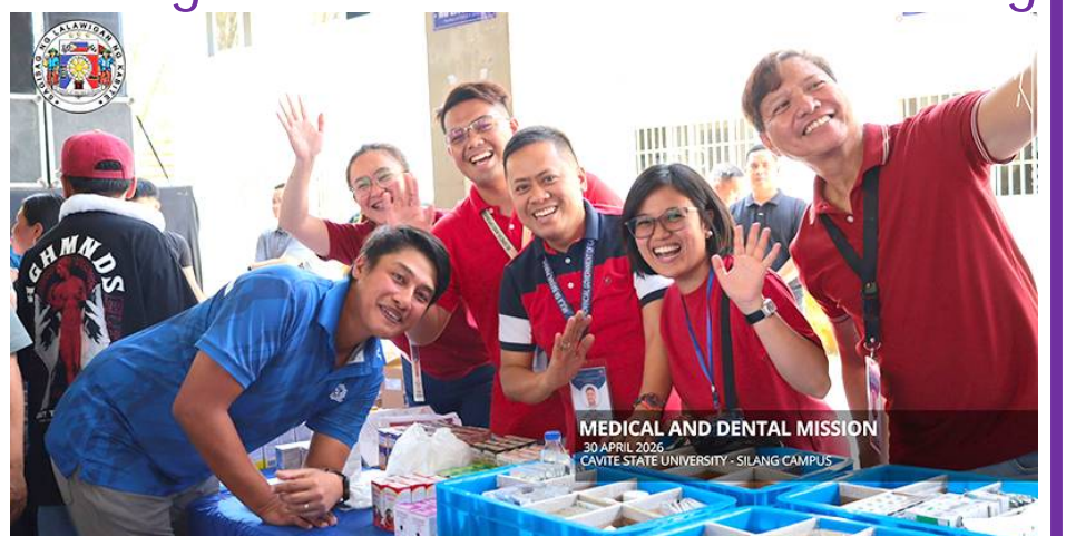
MEDICAL AND DENTAL MISSION 30 APRIL 2026 CAVITE STATE UNIVERSITY - SILANG CAMPUS

community. The large turnout of beneficiaries reflects the growing need for accessible healthcare services, especially in grassroots communities. Through the Cavite Service Caravan, the Provincial Government continues to bridge gaps in essential government ▶ PGC BRINGS • 6