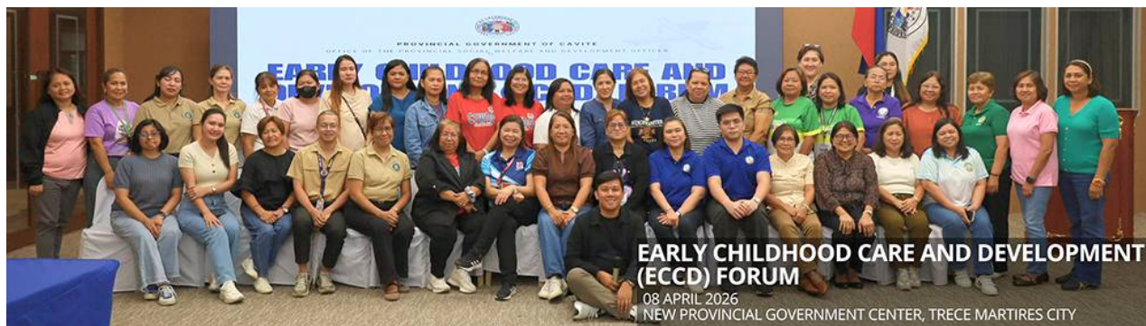
EARLY CHILDHOOD CARE AND DEVELOPMENT (ECCD) FORUM 08 APRIL 2026 NEW PROVINCIAL GOVERNMENT CENTER, TRECE MARTIRES CITY

The Provincial Government of Cavite through the Office of the Provincial Social Welfare and Development Officer successfully conducted the Early Childhood Care and Development (ECCD) Forum on April 8, 2026, at the New Provincial Government Center in Trece Martires City, gathering stakeholders committed to advancing early childhood education and development across the province.