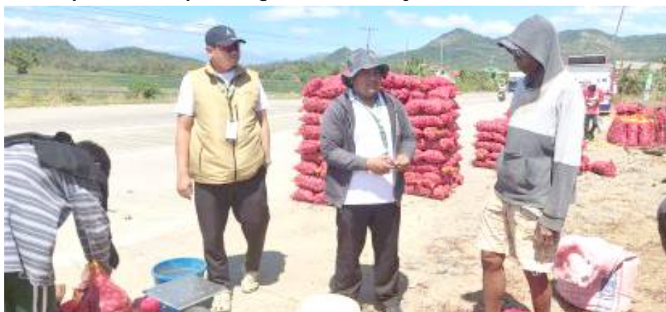
INSTITUTIONAL BUYERS. Onion farmers in Occidental Mindoro in an undated photo. The Department of Agriculture on April 6, 2026 said some eight institutional buyers have expressed interest in sourcing red onions directly from Mindoro, with a potential monthly demand ranging from five to 16 metric tons.

In 2024, Agriculture Secretary Francisco Tiu Laurel said that about 30 percent of the country's