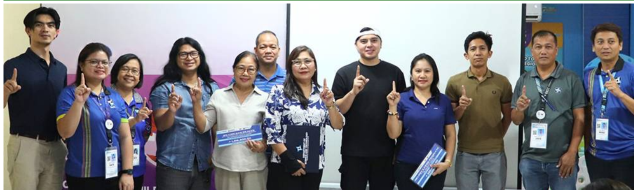
CITY OF SAN FERNANDO, La Union - The Department of Science and Technology Ilocos Region (DOST Ilocos Region) awarded financial assistance to the 2nd batch of 2026 beneficiaries of the Small Enterprise Technology Upgrading Program (SETUP) during a ceremony at the DOST Ilocos Region Innovation Hub held recently. ► DOST ILOCOS • 4