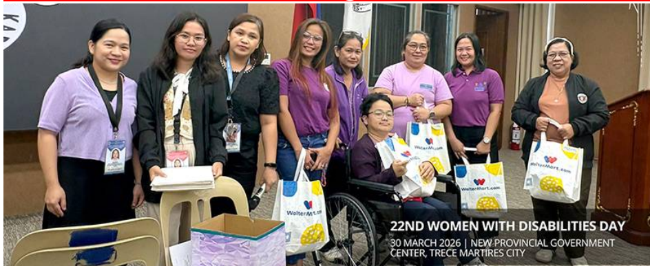
22ND WOMEN WITH DISABILITIES DAY 30 MARCH 2026 | NEW PROVINCIAL GOVERNMENT CENTER, TRECE MARTIRES CITY

The Provincial Government of Cavite, through the Office of the Provincial Persons with Disability Affairs Officer (OPDAO), successfully held a meaningful celebration of the 22nd Women with Disabilities Day held recently, at the New Provincial Government Center in Trece Martires City. ► CAVITE • 5