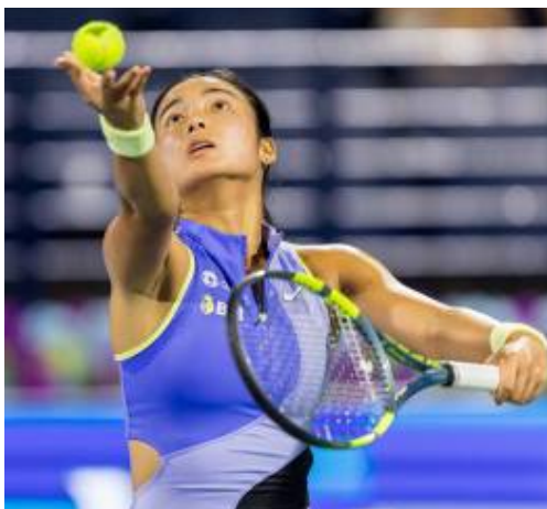
The Philippines' Alexandra Eala

Ostapenko will be up against Romanian Elena-Gabriela Ruse in the Round of 16. ► EALA BOWS • 6