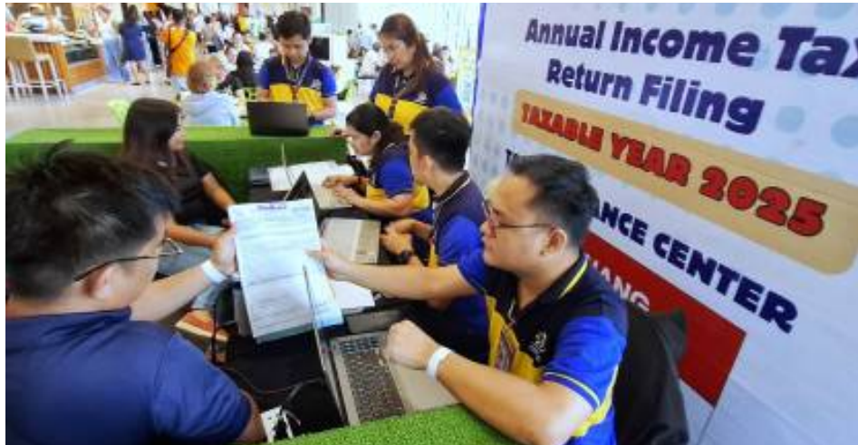
Bureau of Internal Revenue in Davao Region

taxpayer burden, boosts compliance, cuts red tape, curbs corruption, and builds public confidence," Gatchalian added.