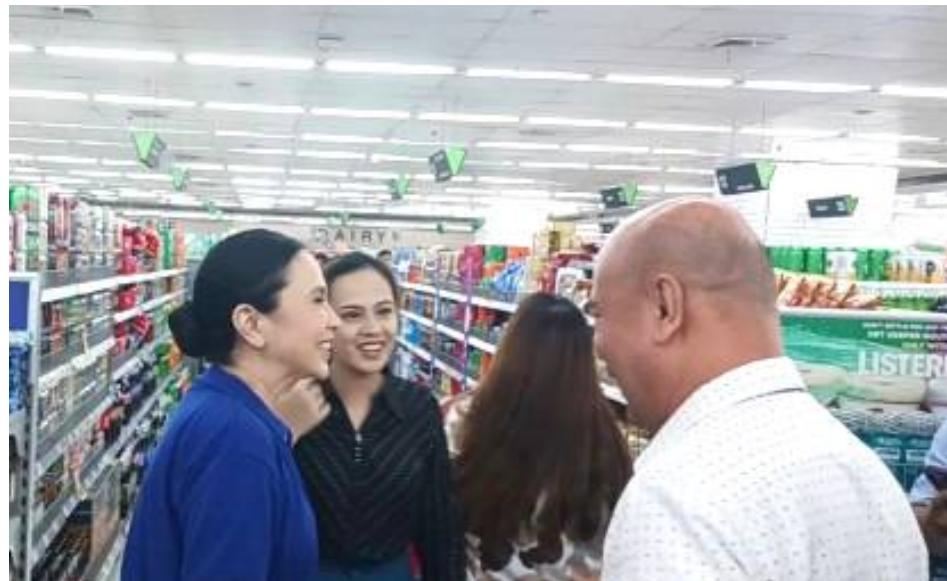
STABLE PRICES. Trade and Industry Secretary Ma. Cristina Roque (left) engages in a conversation during a market monitoring event at a mall in Mandaluyong City on Wednesday (April 8, 2026). She said prices of basic and prime commodities remain stable and that manufacturers have agreed to maintain their prices until the end of April.

MANILA – Prices of basic and prime commodities monitored by the Department of Trade and Industry (DTI) will remain unchanged until April 30, Trade Secretary Ma. Cristina Roque said Wednesday.