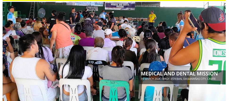
MEDICAL AND DENTAL MISSION 19 MARCH 2026 | BRGY. ESTEBAN, DASMARIÑAS CITY, CAVITE

In a continued effort to bring essential healthcare services closer to the grassroots, a total of 719 residents of Brgy. San Esteban, Dasmariñas City benefitted from a Medical and Dental Mission held on March 19 – an initiative that underscored both reach and responsiveness in public health service delivery. PGC MEDICAL • 4