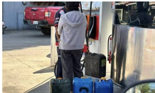
PORTABLE CONTAINERS. An individual purchases gasoline using portable containers at a fuel station in Dumaguete City, Negros Oriental on March 16, 2026. The Department of Agriculture on Friday (March 27) reiterated that farmers and fishers are allowed to buy petroleum products using portable containers.

To ensure compliance, the government has deployed monitoring