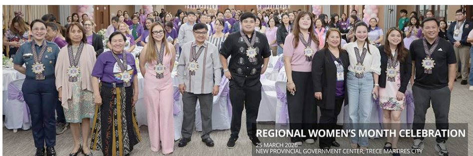
REGIONAL WOMEN'S MONTH CELEBRATION 25 MARCH 2026 NEW PROVINCIAL GOVERNMENT CENTER, TRECE MARTIRES CITY

The Province of Cavite successfully hosted the 2026 Regional Women's Month Celebration on March 25, 2026, at the New Provincial Government Center in Trece Martires City, gathering key stakeholders and advocates from across the CALABARZON region in support of gender equality and inclusive development.