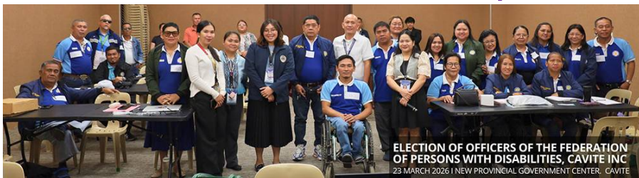
ELECTION OF OFFICERS OF THE FEDERATION OF PERSONS WITH DISABILITIES, CAVITE INC 23 MARCH 2026 | NEW PROVINCIAL GOVERNMENT CENTER, CAVITE

A new chapter of leadership and representation began for the Federation of Persons with Disabilities (PWD), Cavite Inc., following the successful election of its new set of officers on March 23, at the Admin. Function Hall of the New Provincial Government Center, Trece Martires City. PWD FEDERATION • 4