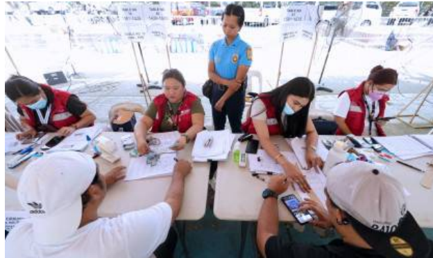
CASH AID. Department of Social Welfare and Development personnel distribute PHP5,000 cash assistance to transport network vehicle service drivers at a payout center at the Quezon Memorial Circle in Quezon City on March 24, 2026. The DSWD on Friday (March 27) urged transport network companies to submit a complete list of their drivers to ensure that no driver is left behind.

MANILA – Department of Social Welfare and Development (DSWD) Secretary Rex Gatchalian on Friday reiterated the DSWD's firm stance on ensuring that all eligible transport network vehicle service (TNVS) drivers and delivery riders are included in the government's cash relief assistance, as he called out gaps in the submitted beneficiary lists from some transport network companies (TNCs).