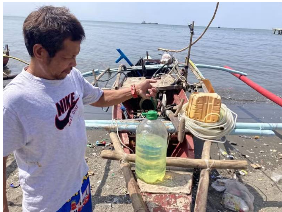
A fisherfolk leader in Cavite shows a gallon of diesel he bought for his fishing trip, following the second tranche of the staggered oil price hikes on Wednesday, March 11, 2026.

A fisherfolk leader in Cavite displayed a four-liter container of diesel he bought for his fishing trip, noting the impact of the staggered oil price hikes.