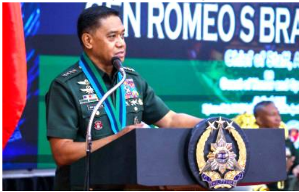
Armed Forces of the Philippines (AFP) chief Gen. Romeo Brawner Jr.

professionalism, technical excellence, and steadfast service in helping build a stronger and more mission-ready Armed Forces. (PNA)