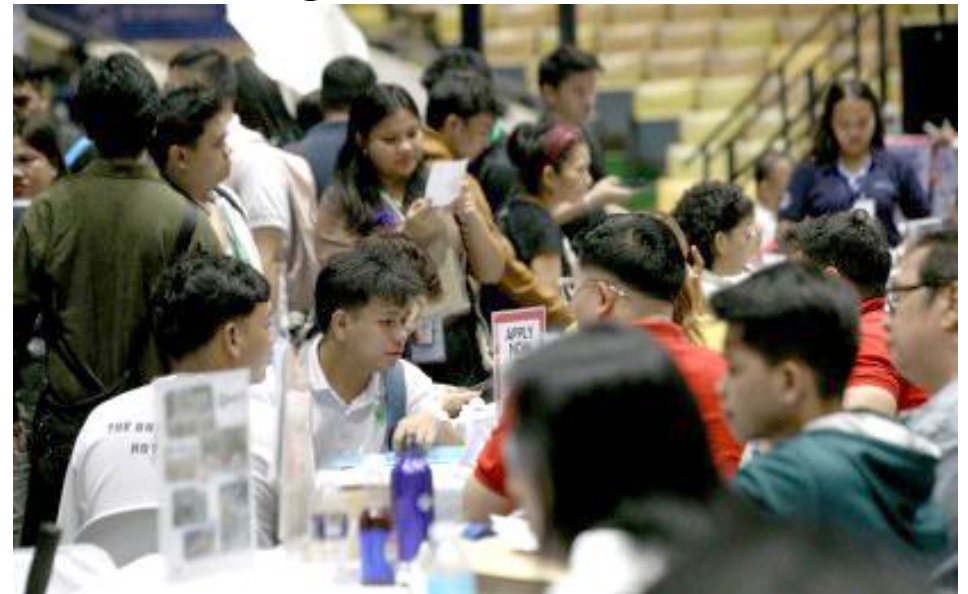
JOB FAIR. Job seekers queue up at the Department of Labor and Employment's 92nd founding anniversary job fair, which coincides with Pasay City's 162nd Foundation Day celebration in Pasay City. With the unemployment rate rising to 5.8 percent in January this year, Department of Economy, Planning, and Development Secretary Arsenio Balisacan said the government will implement reforms to create more and better jobs.

Strategies to promote labor market resilience include diversifying the economy's growth drivers, attracting investment in high-productivity sectors, addressing constraints such as high energy costs and low technology adoption, and facilitating the transition to renewable energy to reduce dependence on imported fuels.