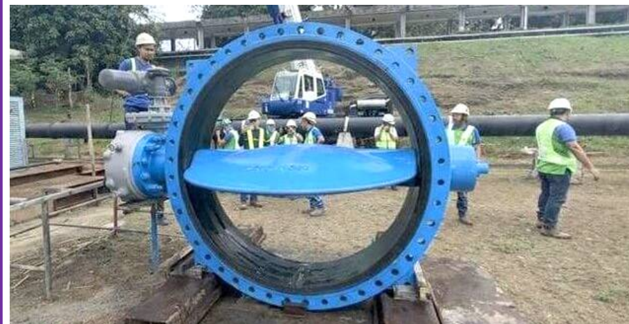
Maynilad personnel inspect a large valve component for installation at La Mesa Treatment Plant 2, which is currently undergoing modernization upgrades to enhance operational reliability in the West Zone.

West Zone concessionaire Maynilad Water Services Inc. is nearing completion of several major water and wastewater infrastructure upgrades aimed at strengthening system reliability and environmental protection across Metro Manila and Cavite.