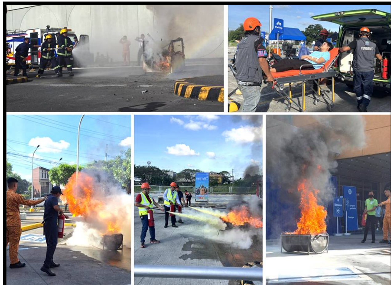
You Are Always Safe Here. As part of the Fifth Nationwide Fire Drill, National Simultaneous Earthquake Drill, and National Disaster Resilience Month, Bacoor, Rosario, and Imus BFP led fire safety demonstrations for employees during a drill at SM City Bacoor, SM City Molino, SM City Rosario, and SM Center Imus this Wednesday, March 3, 2026.