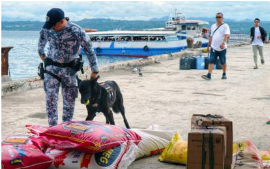
SAFETY INSPECTION. A Philippine Coast Guard K9 inspects passengers' baggage at Sta. Ana Wharf in Davao City in this December 2024 photo. The Philippine Coast Guard, Maritime Industry Authority and Bangsamoro MARINA on Thursday (March 5, 2026) made a joint reaffirmation to intensify enforcement of maritime laws and safety compliance to ensure that no ship can sail without the necessary documents or certificates.

Several Philippine maritime agencies vowed the strict enforcement of laws, rules and regulations in domestic shipping to ensure that no domestic vessel can sail without the required certificates and documents.