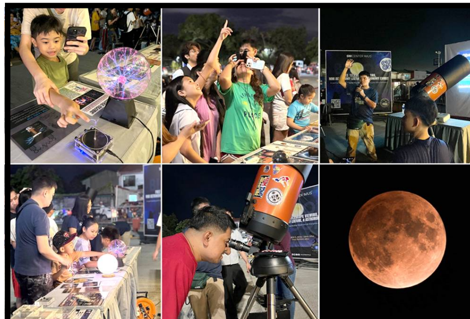
IMUS CAVITE - The night sky turned into a theater of celestial wonder as SM Center Imus hosted a successful community event for the recent Total Lunar Eclipse. Local residents and space enthusiasts gathered at the mall to witness the rare astronomical spectacle, watching in awe as the moon shifted into its iconic blood-red hue. The event was packed with educational opportunities, featuring interactive science displays that explored the mechanics of the solar system. To deepen the experience, experts conducted a series of short talks on moon observation, teaching attendees how to identify key lunar landmarks. The evening concluded with live sky-watching sessions, where families and hobbyists used provided equipment to get a closer look at the unfolding phenomenon.

The participation of DOST SOCCSKSARGEN in this national initiative opens greater opportunities to cultivate more technology-based startups in the region. Moving forward, the agency aims to establish additional innovation hubs across the region and strengthen partnerships with higher education institutions, local government units, and private sector stakeholders to further nurture a vibrant and sustainable startup ecosystem in SOCCSKSARGEN.