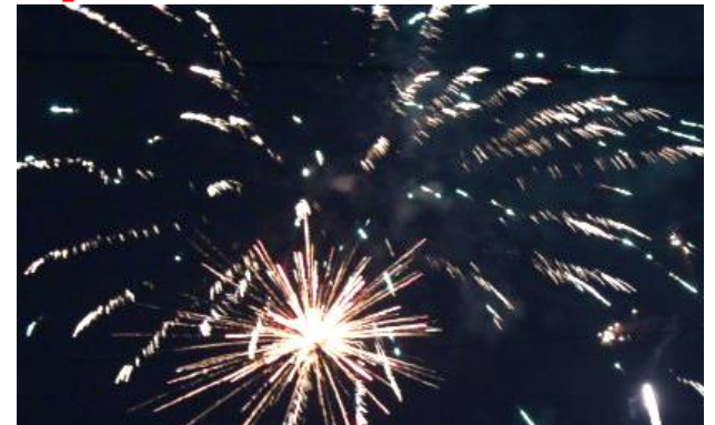
HAPPY NEW YEAR. Fireworks light up the sky in Imus City, Cavite on Thursday (Jan. 1, 2026), as Filipinos welcome the New Year the traditional way. The Philippine National Police said though several people were injured due to firecrackers, the overall celebration was generally peaceful with zero major crimes reported.