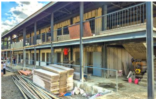
NEW BUILDING. The ongoing construction of a two-story building of the Bukidnon National High School in Malaybalay City on Sept. 9, 2025. Sen. Sherwin Gatchalian on Friday (Jan. 2, 2026) said the 2026 national budget will significantly accelerate classroom construction to address the persistent backlog in basic education facilities. (Contributed photo)