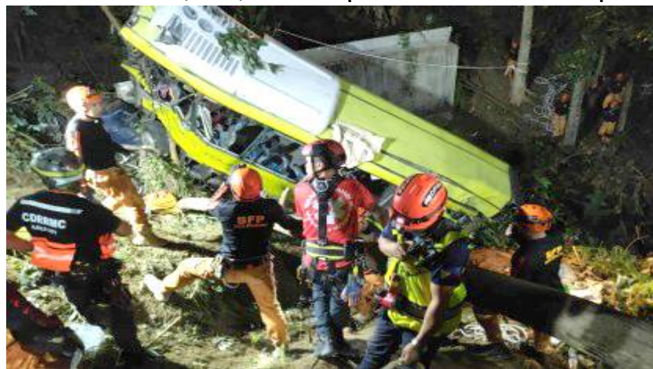
ROAD TRAGEDY. Emergency responders conduct a retrieval operation after a Ceres bus of Vallacar Transit, Inc. fell off a cliff in Barangay Igbucagay, Hamtic, Antique on Dec. 5, 2023. The Department of Health on Friday (Jan. 2, 2026) said 1,113 road crash cases were recorded from Dec. 21, 2025 until 5 a.m. on Jan. 2, 2026, in its 68 sentinel hospitals.

Road crash-related injuries continued to rise during the holiday season, with the Department of Health (DOH) recording 1,113 cases from Dec. 21, 2025 until 5 a.m. on Jan. 2, 2026, based on reports from its 68 sentinel hospitals.