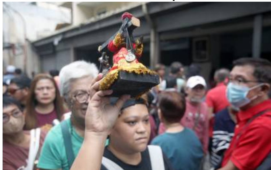
DEVOTION. A Catholic devotee carries an image of the Jesus Nazareno in Quiapo, Manila on Friday (Jan. 2, 2026). Organizers of the annual celebration of the feast of Jesus Nazareno reminded devotees that the blessing of replica images and banners (istandarte) will be held at 1 p.m. on Saturday (Jan. 3).