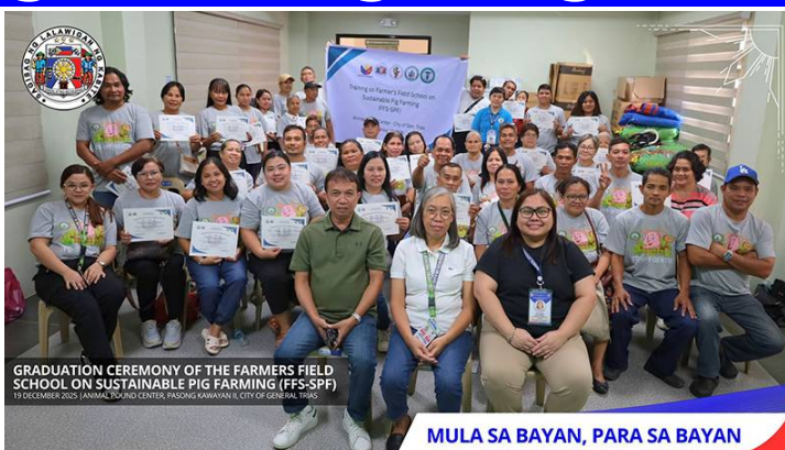
GRADUATION CEREMONY OF THE FARMERS FIELD SCHOOL ON SUSTAINABLE PIG FARMING (FFS-SPF) 19 DECEMBER 2025 | ANIMAL POUND CENTER, PASONG KAWAYAN II, CITY OF GENERAL TRIAS

The program celebrated the completion of learning-by-doing training by local farmers aimed at promoting environmentally sound, safe, and profitable pig farming practices. Participants were equipped with practical knowledge on animal health, biosecurity, and sustainable livestock management to ► GEN. TRIAS • 5