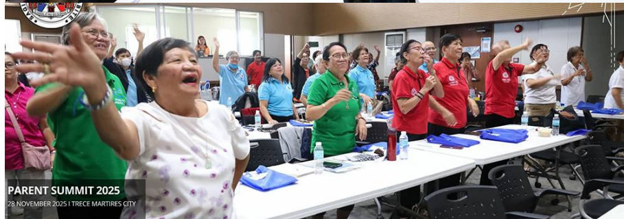
PARENT SUMMIT 2025 28 NOVEMBER 2025 | TRECE MARTIRES CITY

The summit brought together members and officers of the Federation for Senior Citizens Association of Cavite Inc., recognizing their vital contributions to family, community, and society. The gathering