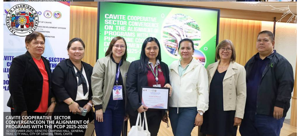
CAVITE COOPERATIVE SECTOR CONVERGENCE ON THE ALIGNMENT OF PROGRAMS WITH THE PCDP 2025-2028 02 DECEMBER 2025 | DENCITO CAMPANA HALL, GENERAL TRIAS, CITY HALL, CITY OF GENERAL TRIAS, CAVITE

With a shared vision of strengthening Cavite's cooperative movement and sharpening its readiness for the opportunities of the coming years, the Provincial Government of Cavite (PGC), through the Office of the Provincial Cooperatives Development Officer (OPCDO), successfully convened the Cavite Cooperative Sector Convergence on the Alignment of Programs with the Philippine Cooperative Development Plan (PCDP) 2025–2028 on December 2, 2025, at the Dencito Campana Hall, City Hall of General Trias.