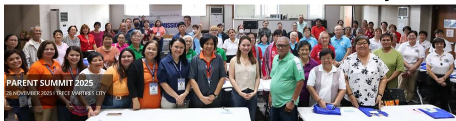
PARENT SUMMIT 2025 28 NOVEMBER 2025 | TRECE MARTIRES CITY