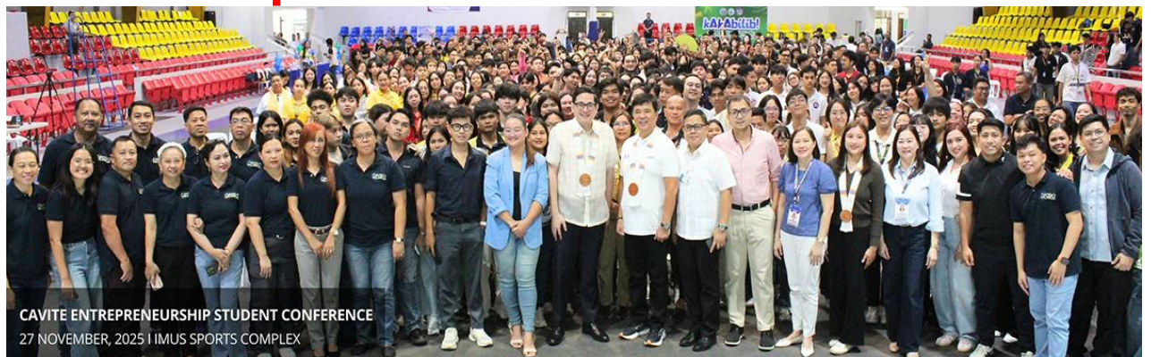
CAVITE ENTREPRENEURSHIP STUDENT CONFERENCE 27 NOVEMBER, 2025 | IMUS SPORTS COMPLEX