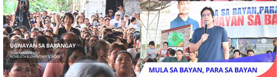
UGNAYAN SA BARANGAY 27 NOVEMBER 2025 NOVELETA ELEMENTARY SCHOOL