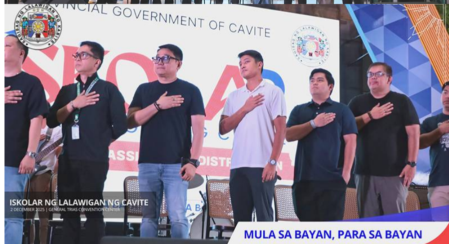
ISKOLAR NG LALAWIGAN NG CAVITE

2 DECEMBER 2025 | GENERAL TRIAS CONVENTION/CULTURAL CENTER