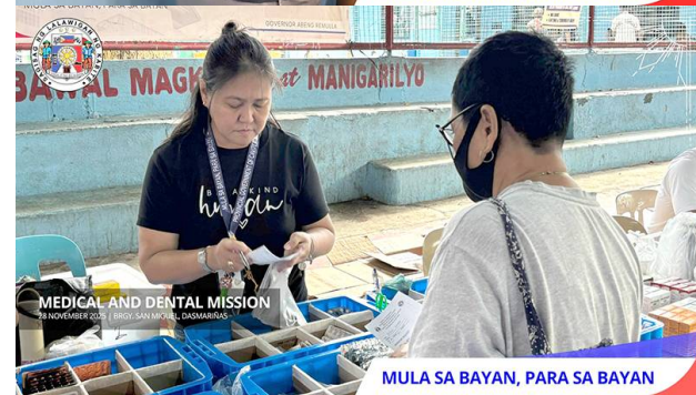
MULA SA BAYAN, PARA SA BAYAN