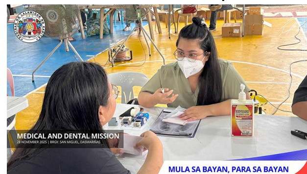
MULA SA BAYAN, PARA SA BAYAN