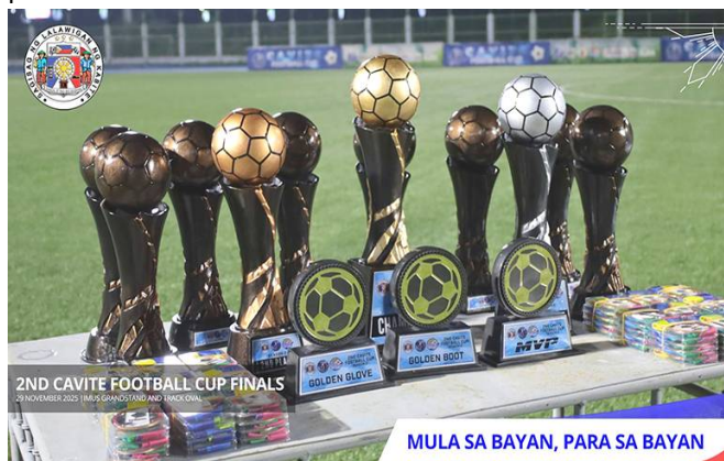
MULA SA BAYAN, PARA SA BAYAN

In a thrilling championship match, the Imus City Gunners clinched the title, securing the top spot after a hard-fought battle against Ciudad de Cavite Futbol, who finished as this year's deserving 2nd place. Earlier in the day, Batang Gentri prevailed in the Battle for Third, earning 3rd place over the Bacoor Football Team, who settled in 4th place.