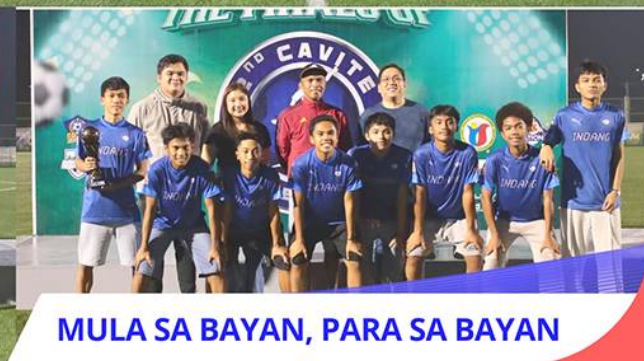
MULA SA BAYAN, PARA SA BAYAN