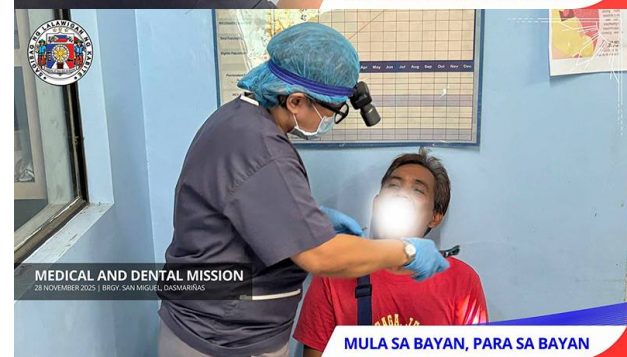
MULA SA BAYAN, PARA SA BAYAN