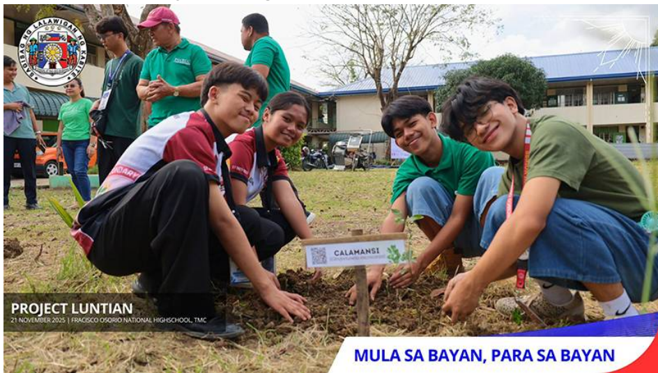
PROJECT LUNTIAN 21 NOVEMBER 2025 | FRANCISCO OSORIO NATIONAL HIGH SCHOOL, TMC

The Office of the Provincial Environment and Natural Resources Officer (OPENRO) Cavite, in partnership with the Department of Education (DepEd) Cavite, spearheaded a tree-planting program aimed at strengthening environmental stewardship among students and educators. Held at Francisco Osorio Integrated National High School on November 21, the event gathered school officials, government representatives, and community volunteers for a day of ecological action.