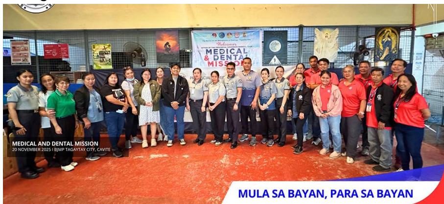
MEDICAL AND DENTAL MISSION 20 NOVEMBER 2025 | BJMP TAGAYTAY CITY, CAVITE

The Provincial Government of Cavite (PGC) successfully carried out a Medical and Dental Mission at BJMP Tagaytay City on November 20, bringing essential healthcare services directly to Persons Deprived of Liberty (PDL). Throughout the day, medical professionals delivered comprehensive support from consultations and dental care to diagnostic procedures ensuring that the health needs of the PDLs were given due attention.