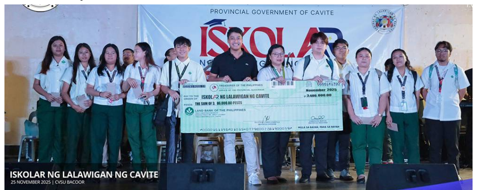
ISKOLAR NG LALAWIGAN NG CAVITE 25 NOVEMBER 2025 | CVSU BACOOR