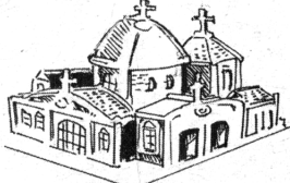
Ang Quiapo church ay itinatayo noong 1588. Si Juan Bautista ang patron nito.