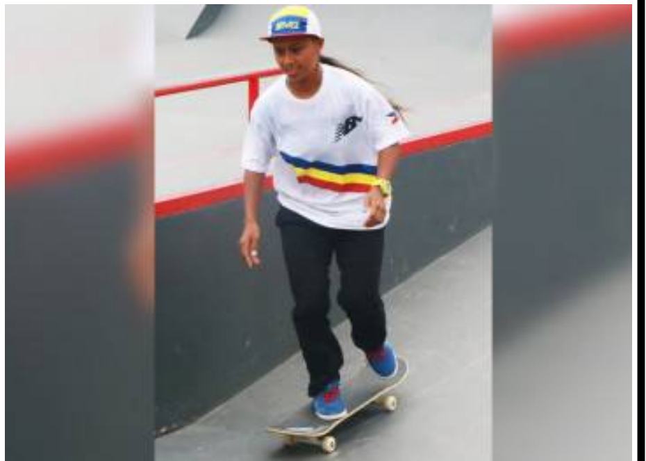
Skateboarding Olympian Margielyn Didal (File photo)

MANILA – Senate President Pro Tempore Jinggoy Ejercito Estrada has filed Senate Resolution 1235 commending Olympian Margielyn Didal for her recent triumphant return to the global skateboarding arena.