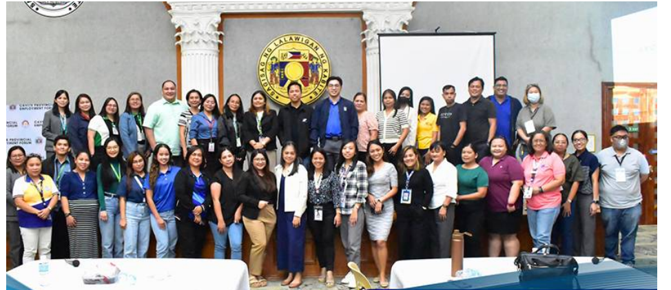
PROVINCIAL STAKEHOLDERS' FORUM 8 NOVEMBER 2024 | SP SESSION HALL, TMC WWW.CAVITE.GOV.PH - WWW.ATHENATOLENTINO.PH