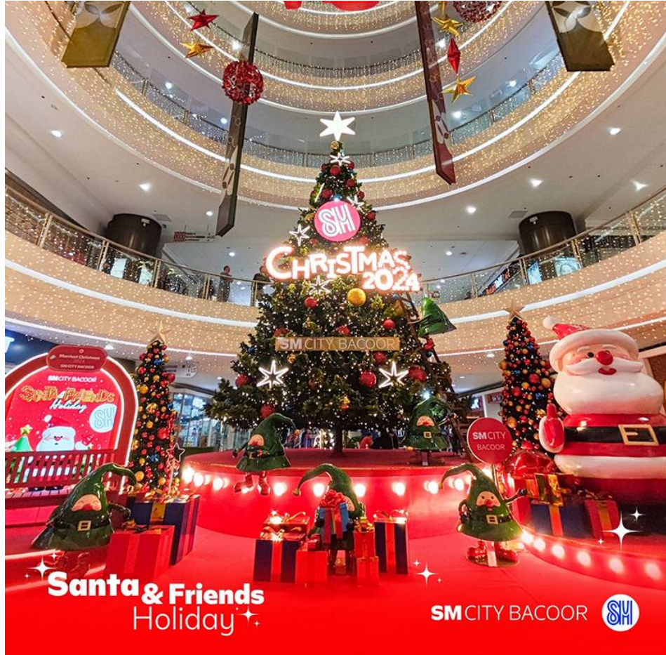
Santa & Friends' Holiday at SM City Bacoor: The holiday magic begins as SM City Bacoor unveil and lits up it's enchanting 'Santa and Friends' Christmas Centerpiece. This festive display features a majestic 30ft Christmas Tree, adorable life-sized elves, and huge presents, bringing joy and holiday cheer to all shoppers. Special guests from Gov. PF Espiritu Elementary School in Bacoor were also present and were thrilled to receive SM Bears of Joy.

Visit SM City Bacoor, SM City Molino, and SM Center Imus for a holly-jolly Christmas!