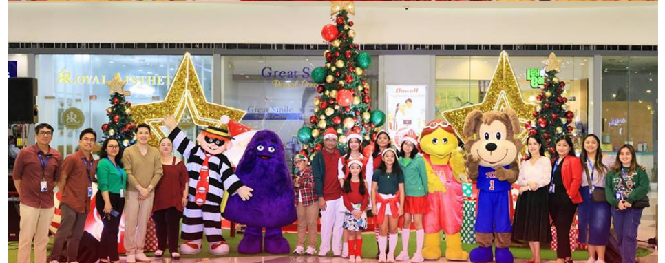
Visit SM City Bacoor, SM City Molino, and SM Center Imus for a holly-jolly Christmas! Santa's Gift Hub at SM Center Imus: SM Center Imus transformed into a holiday haven with its Santa's Gift Hub, officially launched with a tree lighting ceremony at the Mall Plaza. The mall offered a one-stop gift shop, holiday workshops, and exciting promotions. The Raz Singing Cherubim shared a wonderful rendition of Christmas carols to the shoppers and made the celebration merrier.