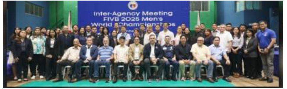
2025 FIVB HOSTING. Members and representatives of the local organizing committee attend the technical working group meeting at Rizal Memorial Sports Complex in Manila on Tuesday (Nov. 5, 2024) for the country's hosting of the FIVB 2025 Men's Volleyball World Championship. Thirty countries, including the Philippines, will join the tournament to be held Sept. 12 to 28, 2025.

Thirty countries, including the Philippines, are seeing action in the world championship. (PR)