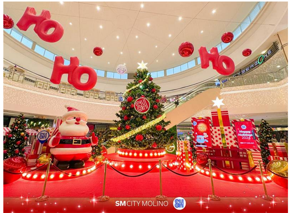
Santa's Holiday Magic at SM City Molino: The magic of Christmas has officially arrived at SM City Molino as Santa's Holiday Magic beautifully lits at the mall's Event Center, bringing more festivity with its 25ft tall Christmas tree and Giant Santa. This year, children from the Malipay Community joined in the celebration and shared in the spirit of giving as they cheerfully received their Bears of Joy. The event was made even more special with happy and festive performances by the Raz Singing Cherubim.