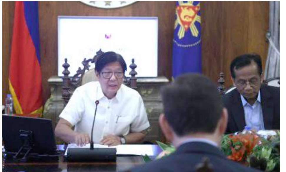
President Ferdinand R. Marcos Jr. (File photo)

The National Economic and Development Authority (NEDA) Board on Tuesday approved the extension of the construction period and other adjustments to the Cavite Industrial Area-Flood Risk Management Project (CIA-FRIMP) and the Pasig-Marikina River Channel Improvement Project (PMRCIP) - Phase IV.