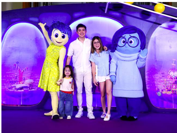
Joy fills the air as families experience a meet-and-greet with "Inside Out 2" characters at SM Seaside City Cebu.

Visit www.smsupermalls.com and follow SM Supermalls on social media for updates.