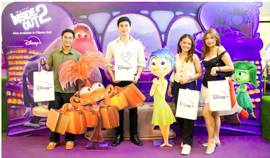
Cebuanos attend the "Inside Out 2" activation at SM Seaside City Cebu.

Fans of the beloved Disney and Pixar film "Inside Out 2" had the opportunity to create lasting memories with their favorite characters at SM Supermalls. Joy and Sadness, the iconic duo from the film's original five-personified emotions (the others being Anger, Fear, and Disgust), made special appearances at SM Seaside City Cebu on October 3, SM City North EDSA on October 5, and SM City Dasmarias on October 6.