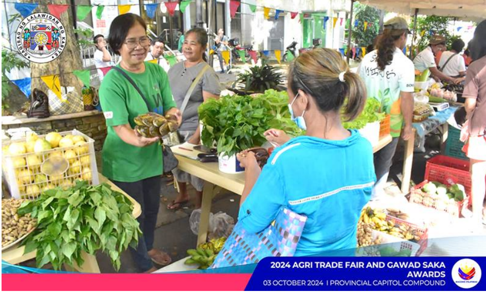
2024 AGRICULTURE TRADE FAIR AND GAWAD SAKA AWARDS 03 OCTOBER 2024 | PROVINCIAL CAPITOL COMPOUND

On October 3, 2024, the Provincial Government of Cavite, through the Office of the Provincial Agriculturist, conducted the 2024 Agri Trade Fair and Gawad Saka Awarding Ceremony at the Provincial Capitol in Trece Martires City. The event, aptly themed "Magsasaka, Mangingisda't Mangangalakal na Kaagapay para sa Kabuhayan, Ating Itanghal at Bigyang Pugay," provided a platform to celebrate the contributions of farmers, fisherfolk, and traders from across the province, while showcasing the best products from various Local Government Units (LGUs).