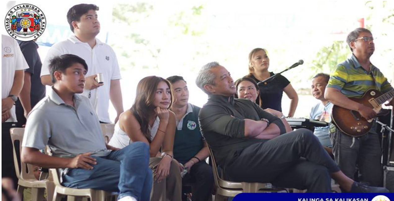
TAPAT SA BAYAN. TAPAT SA USAPAN. KALINGA SA KALIKASAN 3 OCTOBER 2024 | BAGTAS I, TANZA WWW.CAVITE.GOV.PH - WWW.JONVICREMULLA.COM