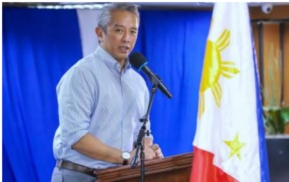
DILG Secretary Jonvic Remulla

Department of the Interior and Local Government (DILG) Secretary Jonvic Remulla on Wednesday vowed to shut down all Philippine Offshore Gaming Operator (POGO) hubs in the country.