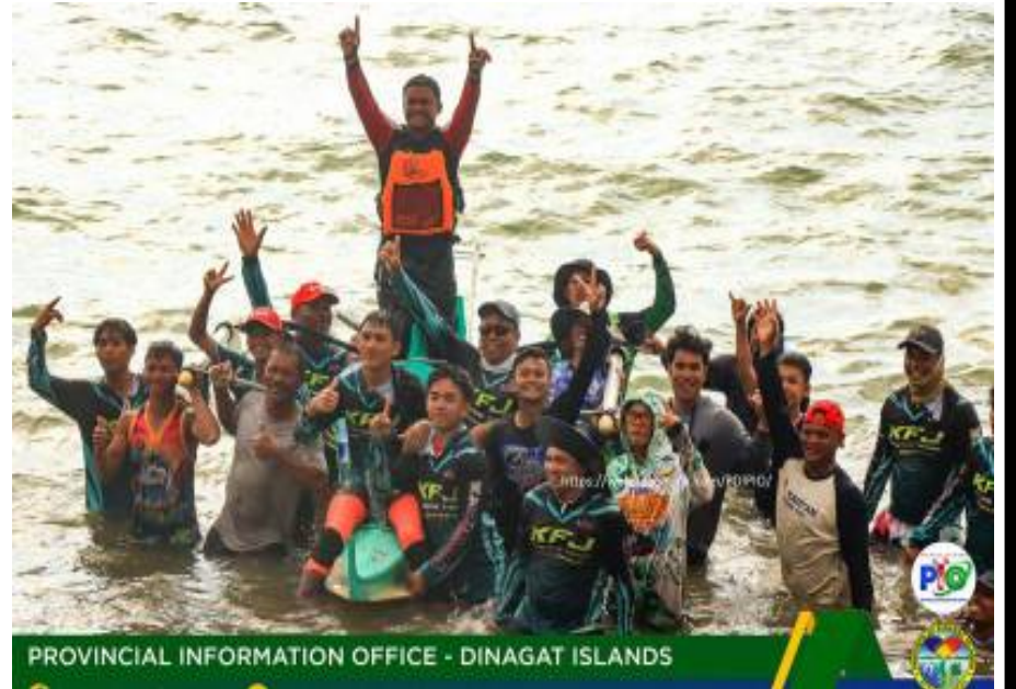
WINNERS. Team KFJ from Borongan, Samar, dominates the 1st National Invitational Boat Racing: The Battle of the Brands, held Sept. 28-29 in the Dinagat Islands. The race is part of the province's 18th founding anniversary celebration, which will culminate on Oct. 2.

BUTUAN CITY – Racers from Borongan, Samar, claimed victory in the 1st National Invitational Boat Racing held in the Dinagat Islands, which concluded Sunday.