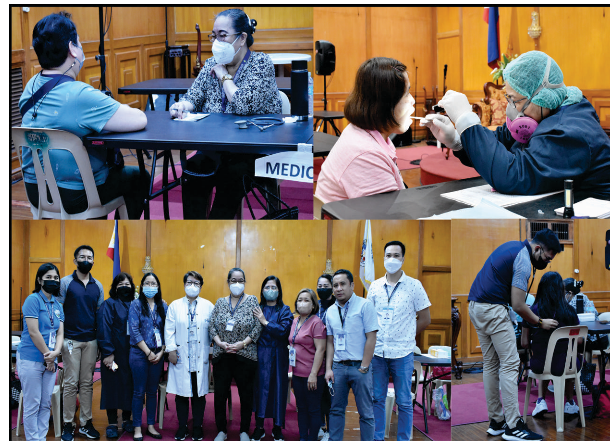
PGC provides medical services for PWD employees. Around thirty (30) employees with disabilities of the Provincial Government of Cavite benefitted from the medical and dental mission organized by the Human Resource Management Office on September 21, 2022 at the Ceremonial Hall, Provincial Capitol Building, Trece Martires City. The medical and dental team of Gen. Emilio Aguinaldo Memorial Hospital rendered their services during the health event which is part of PGC's Employees Month Celebration.

Just like any macroeconomic factor, the global phenomenon affecting our currency can benefit some and hurt others and can be a boon or bane for our economy. It is just up to us to decide whether we make the best of the situation or fall through.