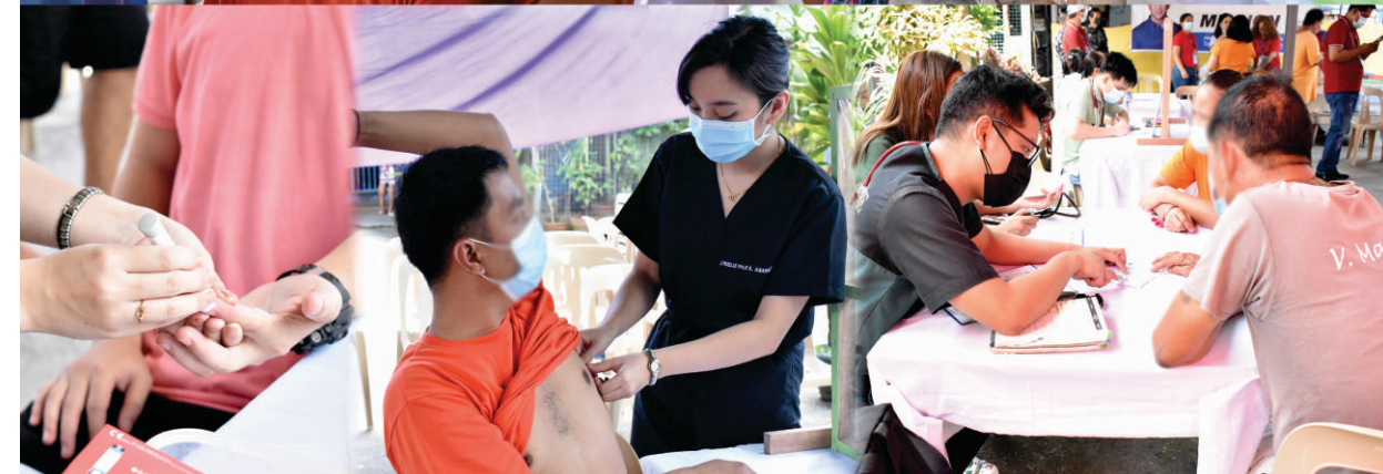
PGC extends health care services to persons deprived of liberty in CPJ. In ensuring the healthcare and wellness on persons deprived of liberty (PDL), the Provincial Government of Cavite through the Office of the Governor - Extension collaborated with the Provincial Health Office and conducted a medical mission at the Cavite Provincial Jail on September 6 and 8, 2022. Almost one hundred eighty (180) PDLs were catered in the said outreach program. Before proceeding to the venue, the medical mission team was subjected to antigen swab testing rendered by PESU team for the safety of everyone. Afterwards, the medical team from PHO rendered free check-up and consultation to the PDLs. The OPG-Extension staff then distributed free medicines and vitamins to them. At the end of the activity, Cavite Provincial Jail administration expressed gratitude to the medical mission team for extending their services.