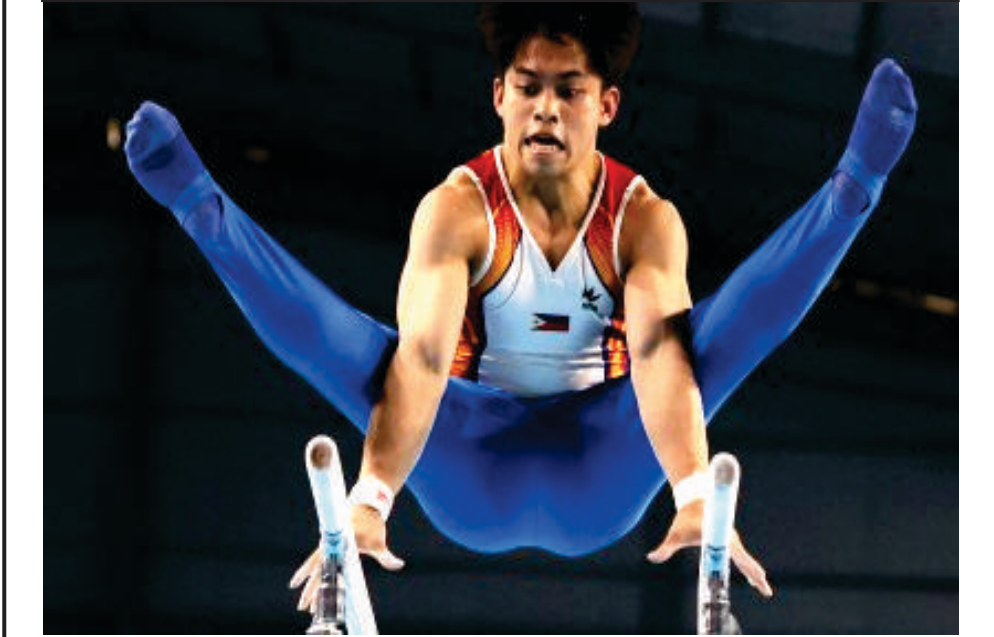
TOP ACHIEVER. Two-time world champion Carlos Yulo shows his winning form to win the parallel bars gold medal in the 32nd Southeast Asian Games in Phnom Penh, Cambodia on May 9, 2023. The Philippine Sportswriters Association (PSA) on Thursday (June 22) announced its top achievers for May led by Yulo.

MANILA - The Philippine Sportswriters Association (PSA) on Thursday announced its top achievers for the month of May led by world champion gymnast Carlos Edriel Yulo.