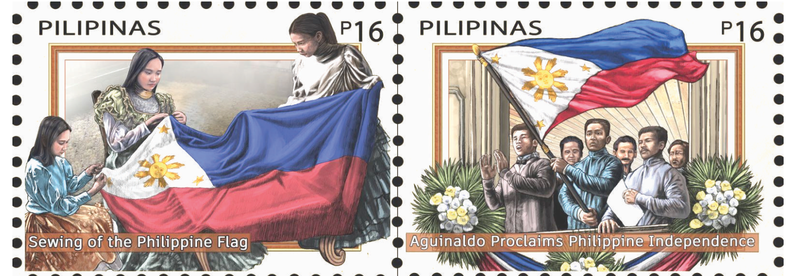
The Independence Day commemorative stamps and first day cover (below).

"We are saddened by this unfortunate incident, but we are lucky