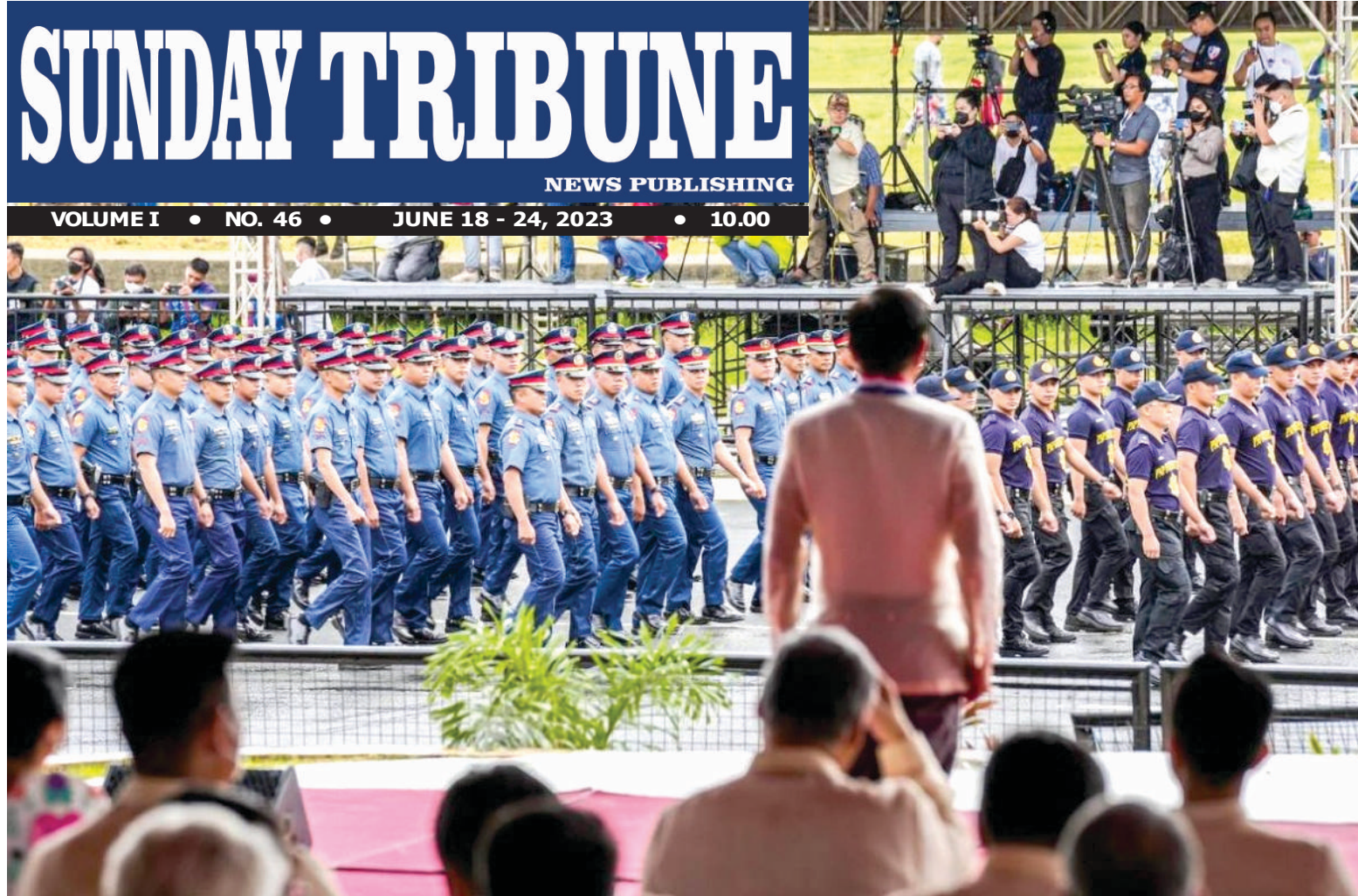
President Ferdinand R. Marcos Jr. leads the 125th anniversary of Philippine Independence and Nationhood with the theme, "Kalayaan, Kinabukasan, Kasaysayan," today at the Quirino Grandstand, Rizal Park in Manila.

In a speech delivered at the Quirino Grandstand, President