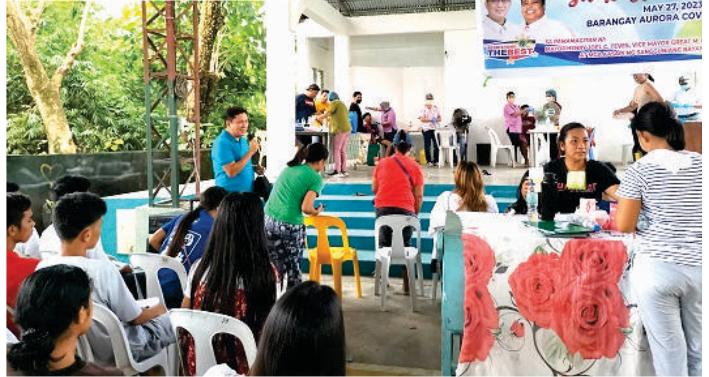
Residents from District 7 in Naujan line up to avail the free dental services offered by the Municipal Government of Naujan and Commission on Human Rights (CHR) Mindoro Provincial Office. (Photo credit: Naujan Public Information Office)

The dental mission is part of the health services offered under the "Bayang Mapagkalinga ng Serbisyong THE BEST" of Mayor Henry Joel C. Teves. (JJGS/PIA Mimaropa-OrMin)