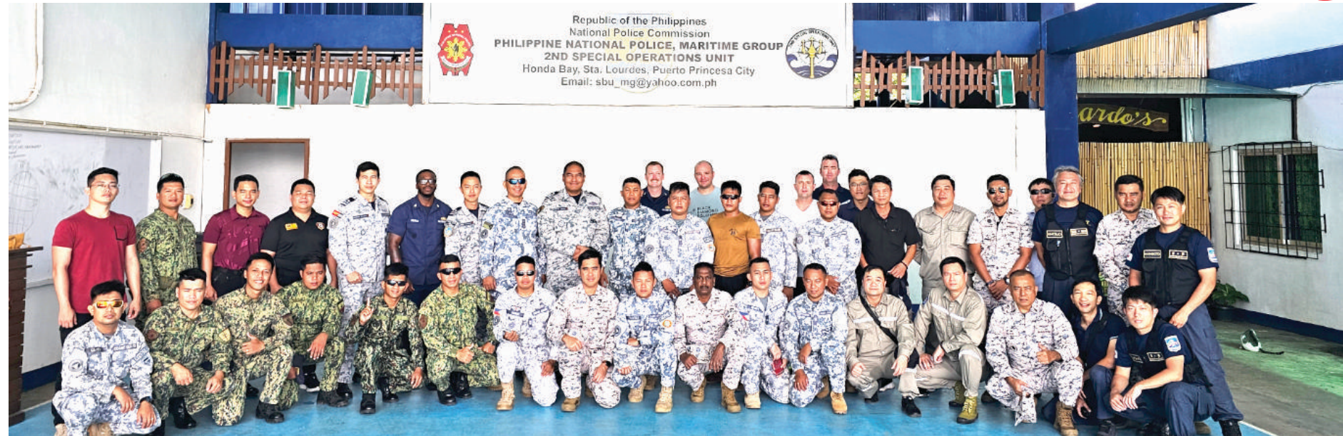
More than 30 participants from the Philippines, Malaysia, Thailand, and Vietnam joined the Multinational Vessel Boarding Officer Course funded by the U.S. Department of State's Bureau of International Narcotics and Law Enforcement Affairs in Puerto Princesa City, Palawan.

Manila—From May 15 to 26, coast guard instructors from the United States, the Philippines, and Japan jointly led a Multinational Vessel Boarding Officer Course in Puerto Princesa City, Palawan that strengthened the maritime law enforcement capabilities of more than thirty participants from Southeast Asia.