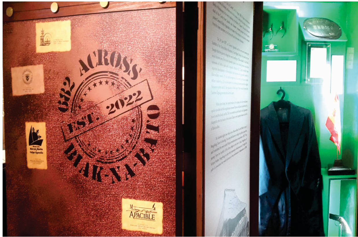
Matutunghayan sa Museo ni Marcelo H. Del Pilar sa Bulakan, Bulacan ang 682 Across Biak-na-Bato Traveling Exhibit bilang bahagi ng International Day of Museums at National Heritage Month.

As National Flag Days continue, the CSC hopes that civil servants and citizens alike will demonstrate their deep love for the country by respecting and upholding the dignity of the Philippine flag, thus fostering