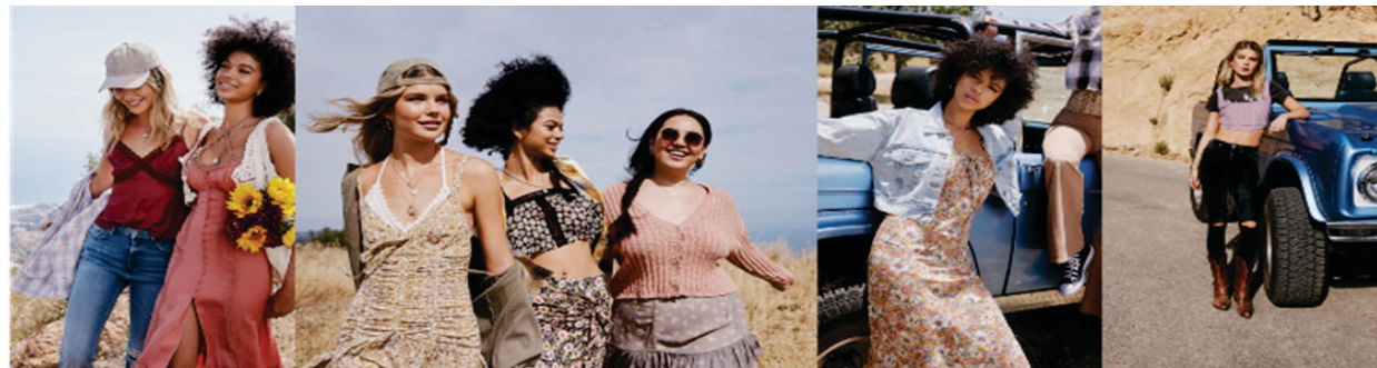
Romantic, bohemian, and forever feminine. Forever 21's satin lace trim cami, distressed flare jeans, plaid button-up shacket, cami midi dress and crochet vest. Pretty and preppy. Cropped cardigan sweater, floral print cropped top and skirt, ruched floral print mini dress, hoop earrings and round-frame sunglasses. Everything Elle. Wear a cropped denim jacket with a floral print midi dress for a cool and relaxed day in school. Available at Forever 21. Get ready for some fun and adventure in school with F21's bustier crop top and distressed skinny jeans.