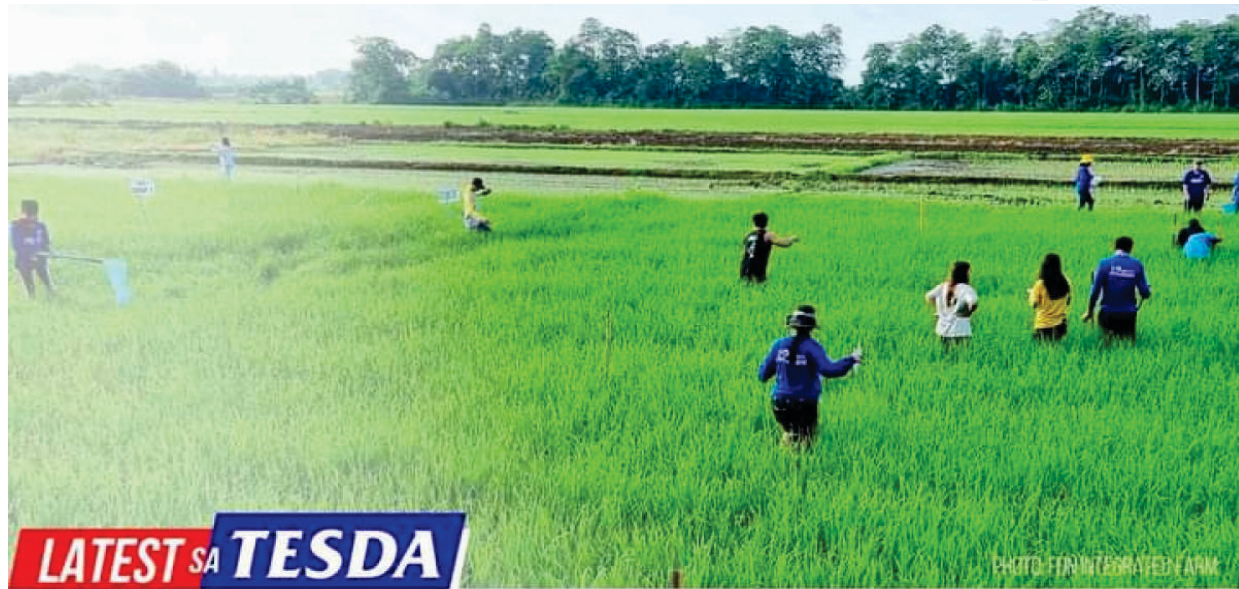
"farmer to farmer, learning by doing" methodology.

As part of its enterprise-based training or "EBT to the Max" initiative, TESDA has been implementing the Program on Accelerating Farm School Establishment (PAFSE) to promote the proliferation of farm schools, and the use of a