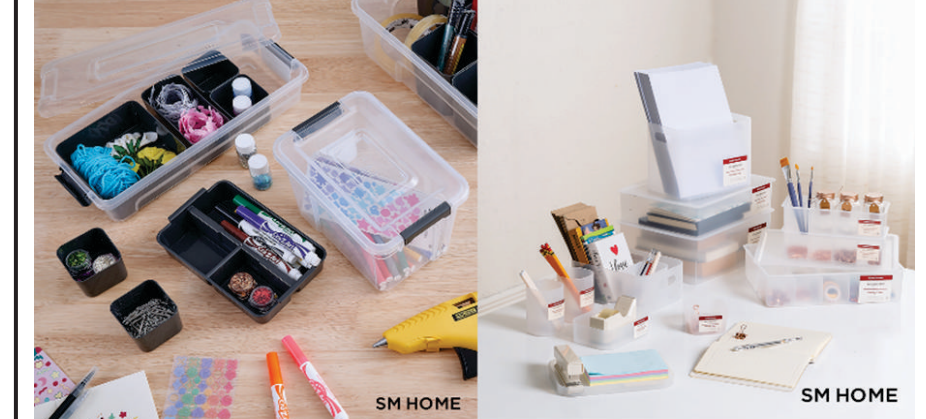
Ezy Storage. Storing stuff is easy with these strong and durable BPA free boxes with double lock handles will keep your items safe around the home or in the office. Home Gallery Zen Collection Vanity Case. Stylish cases ideal for dresser stuff like brushes, make-ups, combs. Best still, it's available in different sizes.

Now is the time to create your dream home as SM Home launches its Home Sale this August! You'll love the great finds and great bargains up to 50% off from select items from August 1 to 31 at all SM Home branches at SM Stores nationwide.