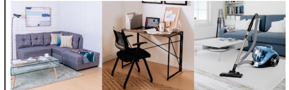
Cheer Sectional Sofa Set. Stylish and elegant L-shaped sofa which gives you more reason to relax at home. Armrest and backrest are padded with Polyurethane foam. Hosh Gorky Harper Computer Desk. A basic design for the study or home office for contemporary compact homes. Tefal Compact Power Cyclonic Bagless Vacuum Cleaner. A vacuum with a compact design and a 2.5 dust capacity container ready for extreme cleaning performance. It's dual-surface suction head and longer cord length makes cleaning a breeze.