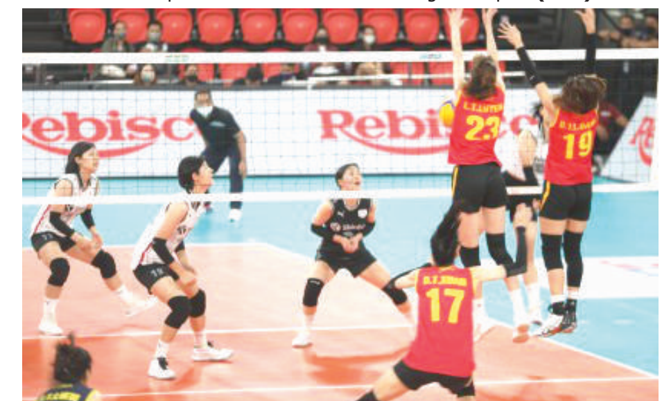
STILL UNDEFEATED. Vietnam shows defensive prowess to beat South Korea in three straight sets in the Asian Volleyball Confederation Cup at the PhilSports arena in Pasig City on Wednesday (Aug. 24, 2022). Vietnam remained undefeated in three games while South Korea absorbed its third straight loss.

Japan leads Pool B with two wins followed by Thailand and Chinese Taipei, which have identical 2-1 (win-loss) records, and Australia (0-2). Thursday's matches will pit Japan against Australia at 1 p.m., China against Iran at 4 p.m. and Korea against the Philippines at 7 p.m. (PNA)