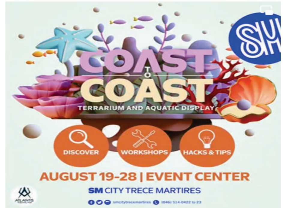
Discover terrarium this August at SM City TreceMartires. SM City Trece Martires brings you Coast-to-Coast Terrarium and Aquascape display this August 19-28! Get a closer look, attend workshop, and learn hacks and tips as you start your terrarium journey!