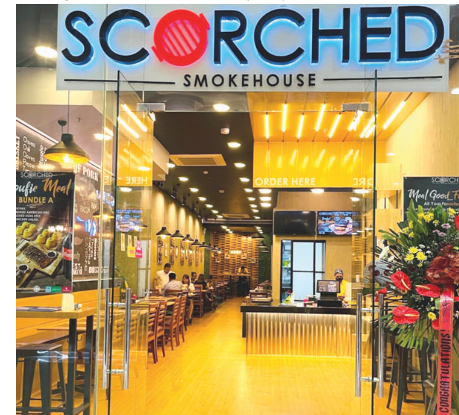
Scorched smokehouse is now open at SM City Dasmariñas: Get scorched and experience smoked beef in another level! Visit Scorched Smokehouse at the Lower Ground Level, Annex!

Nagkakahalaga ng P 181,908.40 ang mga gamot na dinala sa Tingloy BNB. Libreng ipinamimigay ang mga gamot na matatagpuan dito kinakailangan lamang dalahin ang reseta mula sa doctor. Bukod sa Tingloy, operasyonal na din ang BNB sa Sta. Maria, Laguna; Mauban, Quezon; Magallanes, Cavite; at Trece Martires, Cavite. (MDC/PIA-Batangas may ulat mula sa DOH Calabarzon)