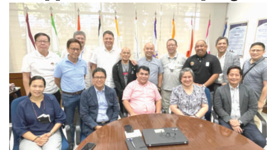
COMMITMENT. Officials of the Philippine National Volleyball Federation (PNVF) and the University Athletic Association of the Philippines (UAAP) pose for photo opportunity after meeting at Adamson University in Manila on Tuesday (Aug. 16, 2022). The UAAP committed to support the volleyball national team program.

"The Vietnam and Cambodia SEA Games were scheduled in May, not the traditional SEA Games schedule of November up to December because of