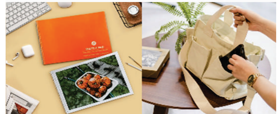
Unleash your creativity with these sketchpads from SM Stationery. Keep your school stuff together with this canvas shoulder bag.