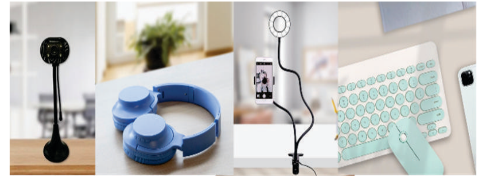
Stay selfie ready with this webcam with stand. Bluetooth headset for your online lectures. Selfie ring light with lazy pod available at SM Stationery. A pastel-colored mouse and keyboard combo for your online class set up.

implement nutrition programs targeting not only the health aspect but other concerns including the environment have won them various recognition from the city, the province, and the region. Their barangay has also been chosen in many benchmarking activities of different LGUs and organizations. Participants signed a commitment of support to nutrition programs and the advocacy to invest more in successful nutrition interventions. (RBF/PIA-Cavite with reports from PICAD)