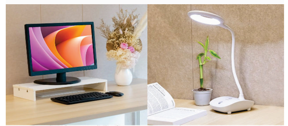
Monitor riser for your daily classes available at SM Stationery. Rechargeable desk lamp for your daily reading.