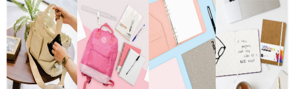
Metallic pink Casio calculator puts the glam in numbers. All in one school backpack for only Php 299. Minimalist Paper Source A5 and A6 planners to keep your schedule on track. Artherapy dotted notebooks will help you keep your goals on the dot.