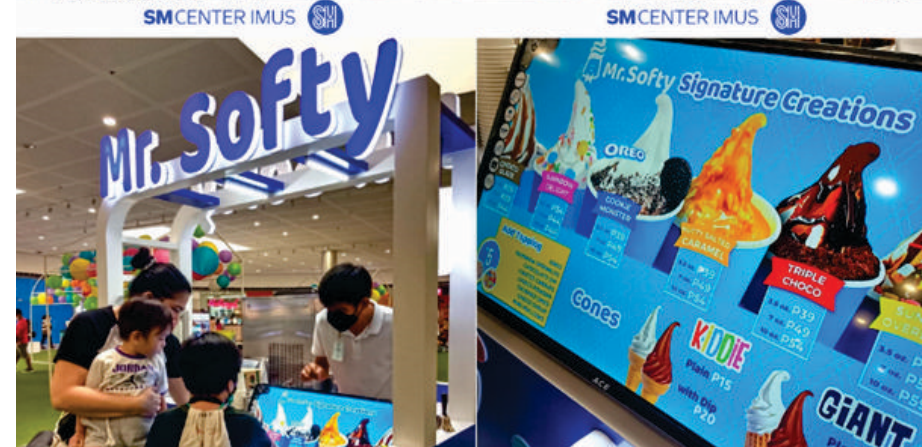
SOFT AND CREAMY CRAVINGS WITH MR.SOFTY – SM CENTER IMUS, CAVITE – Ice cream solves everything! So don't miss this cute kiosk that brings so much smiles on the faces of kids and those who are young at heart. Have a taste of the must-try Mr.Softy Signature Creations, flavor's you'll surely come back for! Visit Mr.Softy at SM Center Imus today and refresh your day in the sweetest way!