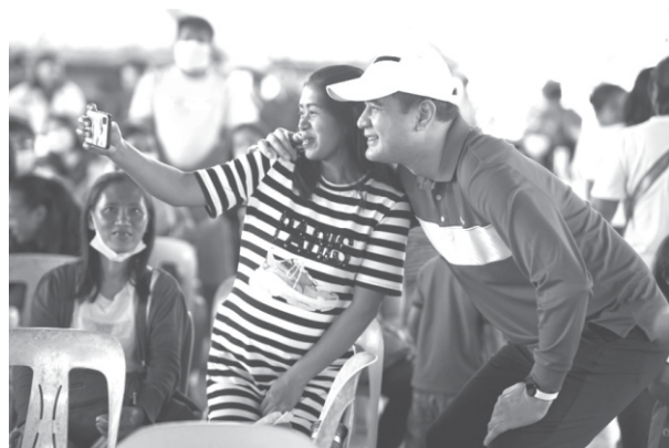
During the I Love Quirino 'Pinasayang' Caravan, Governor Dax Cua expresses his thanks to kailians for their trust and support.

percent, the highest among the Philippines' 81 governors, in its independent and non-commissioned Boses ng Bayan national performance evaluation survey of the country's "top performing