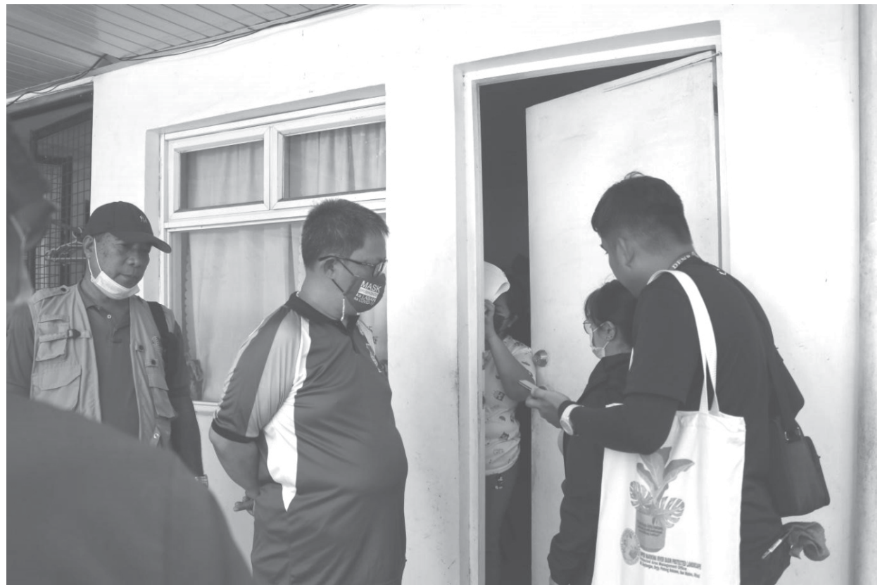
DENR-CALABARZON issues show cause order to owners of structures within protected areas

Ayon sa Section (n) at (o) of RA 7586, as amended, kailangang makakuha ng pahintulot mula sa PAMB at DENR