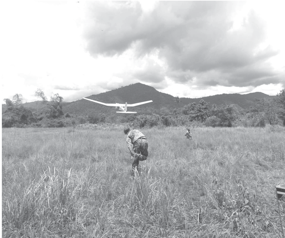
Ipinakita ng isang miyembro ng United States Marine Corps (USMC) kung paano ang pagpapalipad ng drone o ang unmanned aerial system (UAS) sa isinasagawang KAMANDAG Exercise 2022 sa Palawan.

Magtatapos ito sa Oktubre 13, 2022.