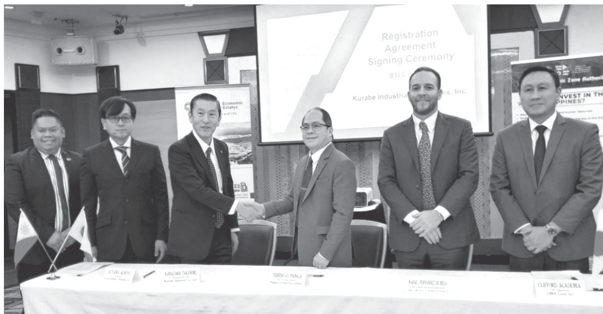
PHILIPPINE ECONOMIC ZONE AUTHORITY | PEZAPH | 8551-3451 | www.peza.gov.ph | info@peza.gov.ph

the region and we would be honored to welcome more Japanese [investment] leaders." (PEZA)