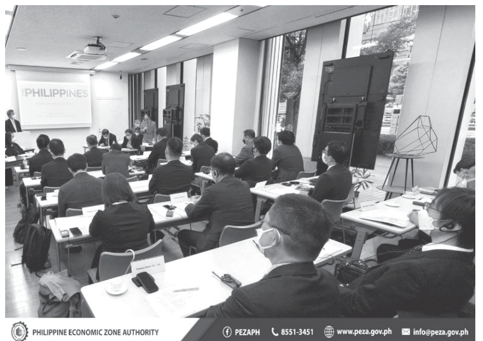
Roundtable Meeting between Japanese EV stakeholders and BOI, DOE, and PEZA.

Under the MOU Signing with Junca Global Partner, Inc., PEZA and Junca shall aggressively promote the Philippines as an investment destination not only for the established manufacturing