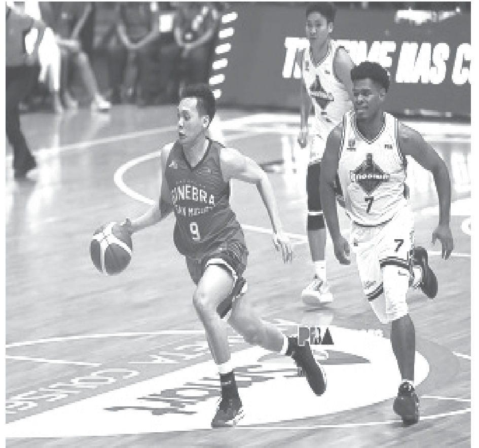
Ginebra's Scottie Thompson (with ball): 16 points, 8 rebounds, 6 assists (PBA Images)

added 14 points, one rebound, and one assist, and Cam Krutwig had 11 points, 15 rebounds, six assists, and three steals for Blackwater, which was sent to the brink of elimination after falling to 3-8, losing five straight games. (PNA)