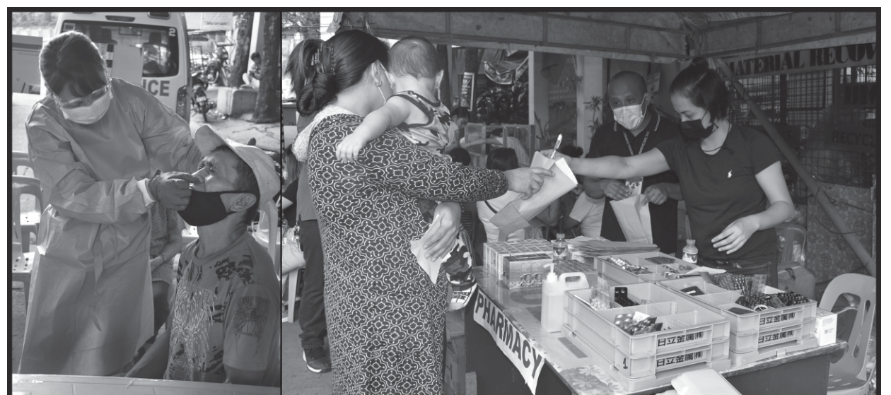
Health outreach event in GMA, Cavite. Another health outreach event was successfully conducted for the benefit of Brgy, Teniente Tiago residents in Gen. Mariano Alvarez, Cavite on October 14, 2022. Volunteers from OPG-Extension and Provincial Health Office led the provision of basic medical services to more than 70 beneficiaries. Before the medical consultation, patients underwent screening as well as antigen testing to ensure the safety of everyone. Likewise, medical mission team strictly observed minimum safety health protocols during the conduct of activity.

NOTE: All news articles and opinions expressed by the writers are entirely their own and do not reflect the opinion of the Publisher, Management of this Publication.