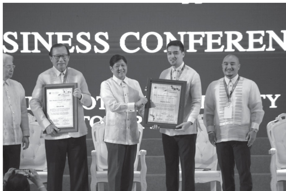
Tinanggap ni Pasig City mayor Vico Sotto mula kay Pang. Ferdinand 'Bongbong' R. Marcos, Jr. ang parangal sa lungsod na kinilala bilang "Most Business-Friendly LGU" sa NCR.

Idinagdag din ni Sotto na sa mga susunod na mga buwan ay magiging mas madali pa ang pagnenegosyo sa Pasig sa pamamagitan ng systems at physical improvements sa Office of the Building Official, pagtatayo ng bagong business one-stop-shop, patuloy na capacity building para sa mga kawani ng pamahalaang lungsod, at iba pa. (Pasig City/PIA-NCR)