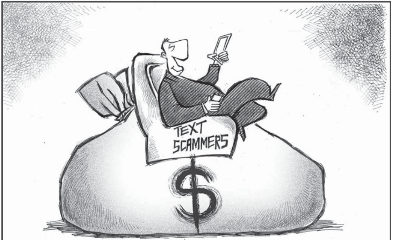
Text scammers got 'millions of dollars'-DICT

The development of the 110,000-square-meter new terminal building aims to decongest the Ninoy Aquino International Airport (NAIA) in Metro Manila and targets to service around eight million passengers annually.