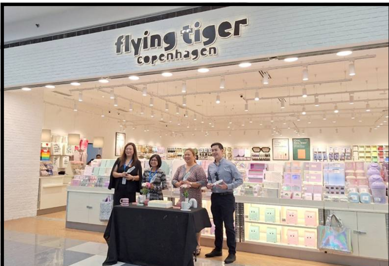
Get Ready to Smile: Flying Tiger Copenhagen Lands at SM City Dasmariñas—First in Cavite! We are thrilled to announce the grand opening of Flying Tiger Copenhagen at SM City Dasmariñas! Discover a world of fun and functional products perfect for your home, school, and more. From quirky kitchen gadgets to stylish stationery, every item is thoughtfully designed to bring a smile to your face. Join us and explore a delightful selection of unique and affordable finds that are as useful as they are cute!