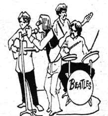
Ang Beatles ang pinakamabentang music group sa kasaysayan ng musika. Tinatayang 500 million plaka ang binili ng kanilang fans.