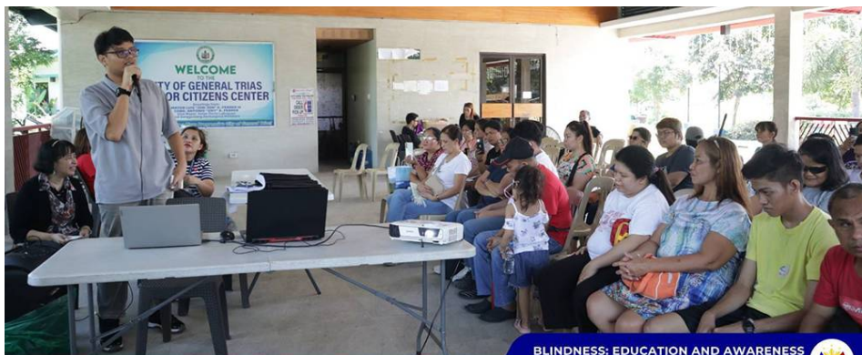
TAPAT SA BAYAN. TAPAT SA USAPAN. BLINDNESS: EDUCATION AND AWARENESS 02 AUGUST 2024 | JOENERA TRIAS CITY, CAVITE WWW.CAVITEGOV.PH - WWW.JONVICREMULLA.COM

Through inspiring talks, meaningful discussions, and the generous distribution of white canes, the event highlighted the collective effort needed to create a more inclusive and accessible society for all. (Axel A. Sarte)