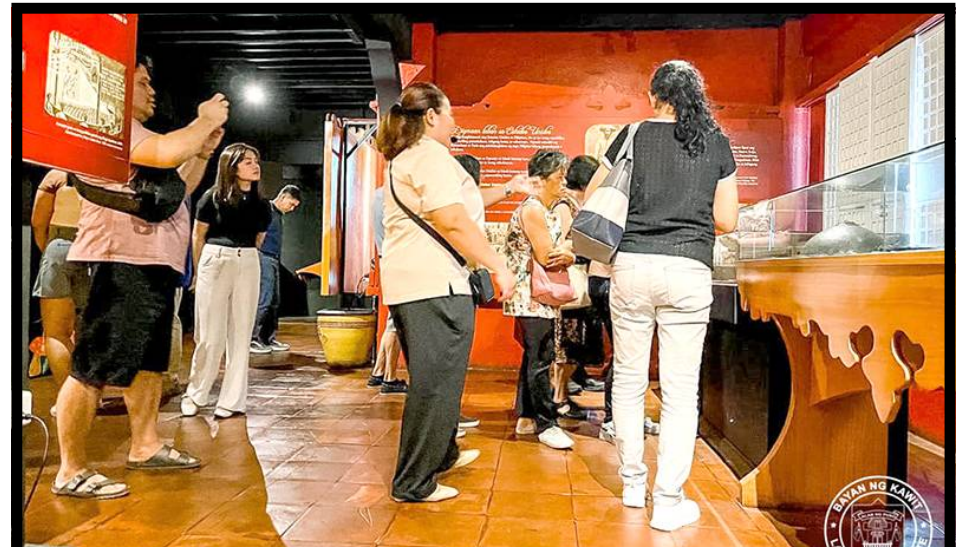
#TaraSaKawit na ngayong History Month! Nakiisa po tayo sa media day ng NHCP ngayong araw at nakasama natin ang ilang mga bisita at media personnel na nag-tour sa ating Aguineldo Shrine. Isa po ito sa ating pagsubok para mas mapahalagahan natin ang ating turismo sa Kawit at magbigay saysay sa ating bansa. Open po ang ating Museo ni Emilio Aguinaldo tuwing Martes hanggang Linggo, alas-9 ng umaga hanggang alas-4 ng hapon. Kaya, #TaraSaKawit na! #RatedTripleA #PusoAtMalasakitParaSaAtingKawit #MayorAguinaldo