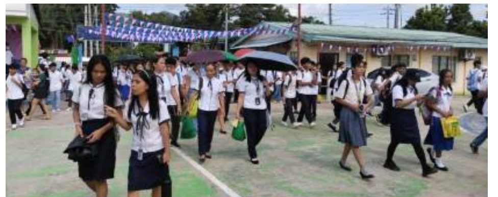
ALL SCHOOLS OPEN. Students flock to the Northern Tacloban City High School during the first day of classes on July 29, 2024. The Department of Education on Tuesday (Aug. 6, 2024) said all public schools nationwide are now open.

These include school bags, a pair of rubber