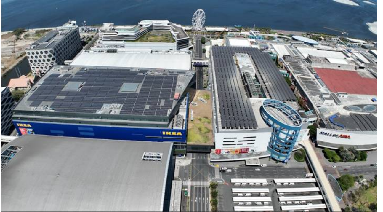
More than 3,600 solar panels were installed on the roof of MOA Square in the Mall of Asia Complex.

In 2022, SM Prime secured a long-term deal with AboitizPower for its clean energy supply. Under the agreement, AboitizPower will provide reliable and responsibly-sourced energy from Tiwi-MakBan Geothermal Power Plants, and PV Sinag's Power Plants, operated and managed by AboitizPower subsidiary, Aboitiz Renewables, Inc. (ARI).