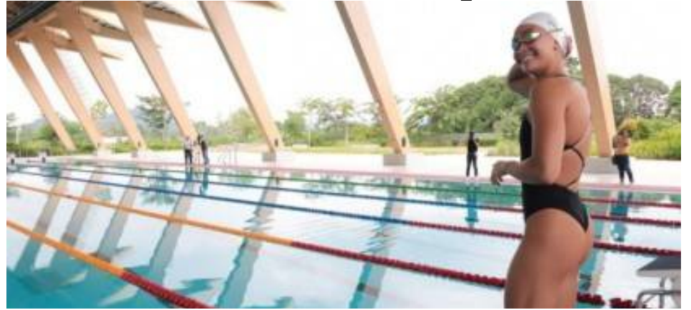
MEDAL CONTENDER. Kayla Sanchez trains at New Clark City in Capas, Tarlac in 2022. She advanced to the women's 100-meter freestyle semifinals of the Paris Olympics at La Defense Arena on Tuesday (July 30, 2024).