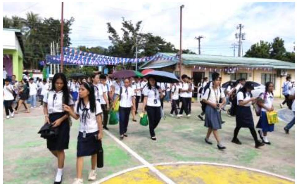
BACK TO SCHOOL. Students flock to the Northern Tacloban City High School during the first day of classes on Monday (July 29, 2024). The Department of Education reported that some campuses in the town centers of Eastern Visayas are dealing with overcrowding as parents prefer to enroll their children in central schools and not in campuses near their communities.

The official said they have been advocating for parents to have their children enrolled in schools in their villages. Those students who can't be accommodated in central schools are referred to