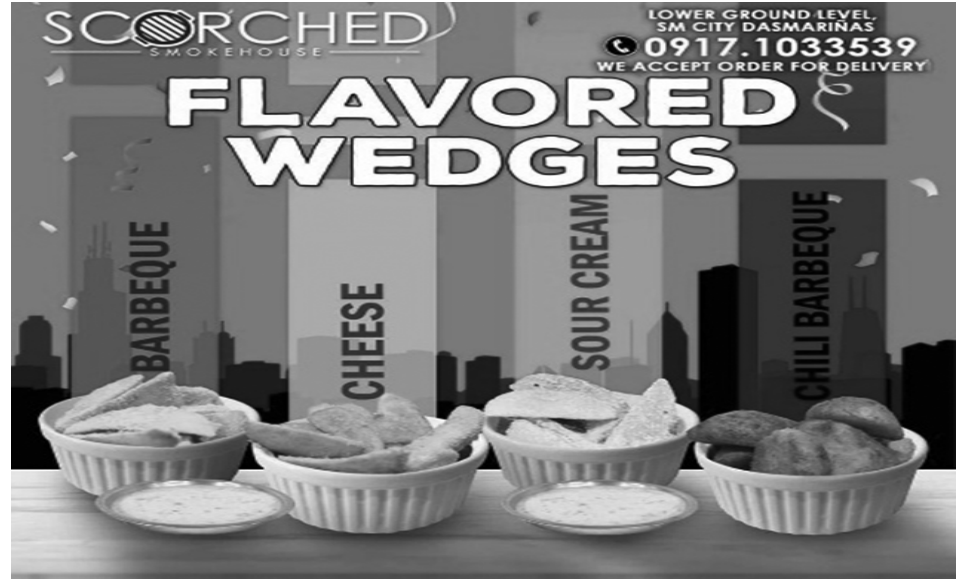
Indulge your cravings with Scorched flavored handcut wedges. Who can refuse these? Hurry! Scorched Smokehouse is located at Lower Ground Level Annex-SM City Dasmariñas

Group is looking at expanding its operations in the Philippines by developing airport outlets for duty-free retail tourism. | PND