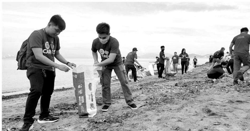
SM City Olongapo Central and SM City Olongapo Downtown return to Kalaklan Parola for a clean-up

SM's goal was to gather the biggest haul of trash and marine debris. This year's efforts amounted to 75,033kg collected with the support of SM's biggest participation since 2015 – 15 SM malls in 12 locations in Luzon, Visayas, and Mindanao. This enabled more volunteers, totaling 17,026 SM employees and members of various sectors to join more clean-ups throughout the country.