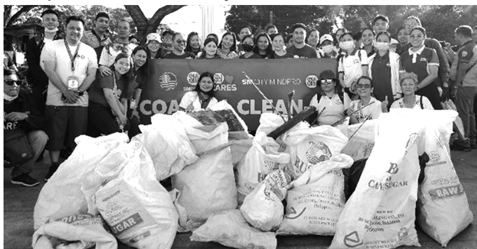
SM City Mindpro show their trash collected along Basilan Strait

SM Cares continues to drive active participation in ocean conservation by taking part once again in this year's International Coastal Cleanup Day last September 16, 2023, Saturday.