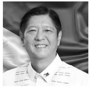
President Bongbong Marcos

"Good luck and ingat palagi ang we're hoping ► PBBM GETS • 4