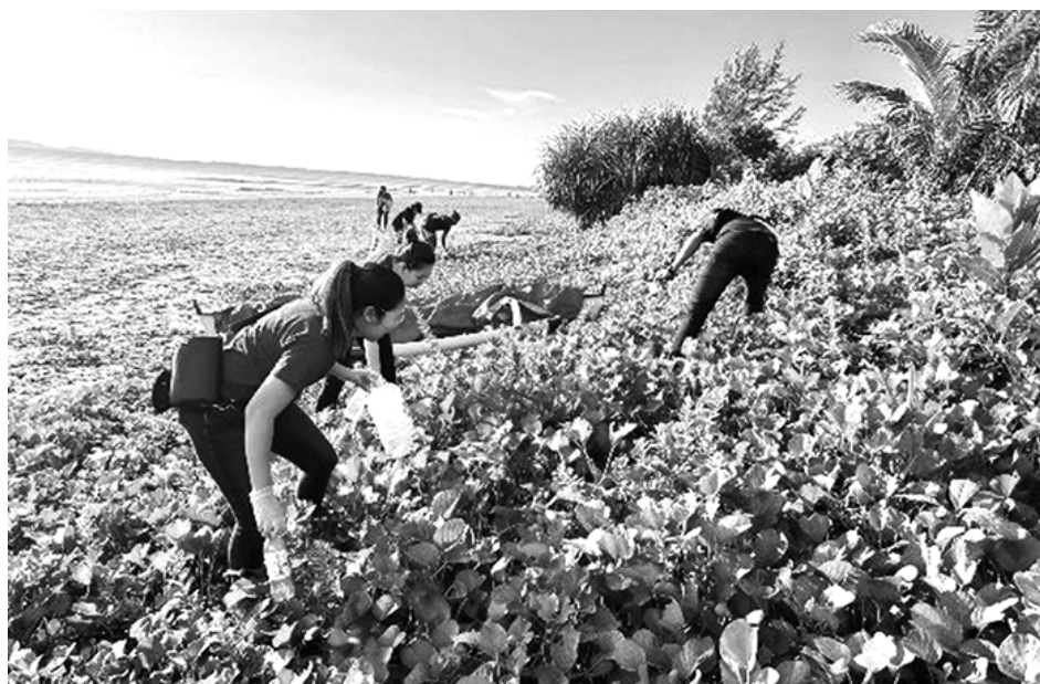
Bagasbas Beach gets greener with a clean up by SM City Daet