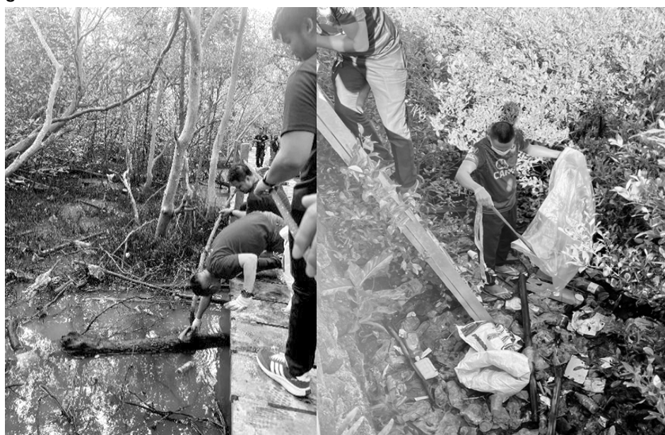
SM City Bataan cleans coastal SM City Sorsogon does a clean-up by the barangays by the Balanga Wetland pier site of Brgy. Talisay & Bitan-o and Nature Park