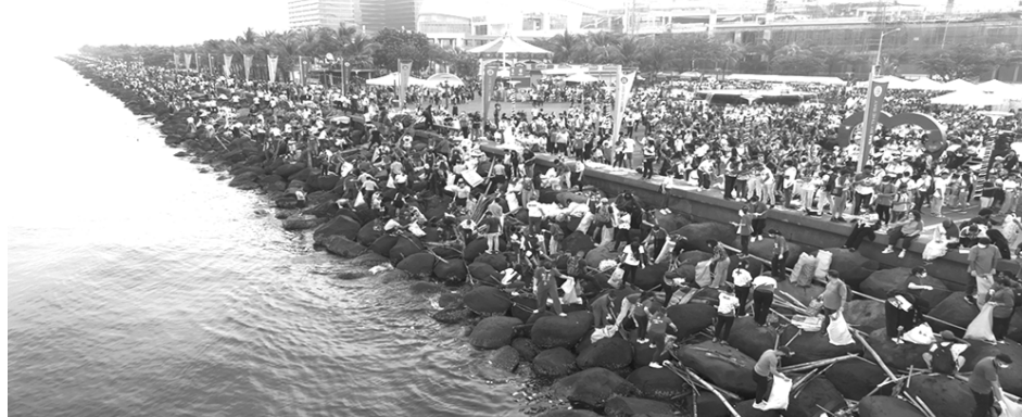
SM Supermalls has participated in the International Coastal Clean Up since 2015, becoming an avenue for volunteers to work together towards a cleaner, greener future.