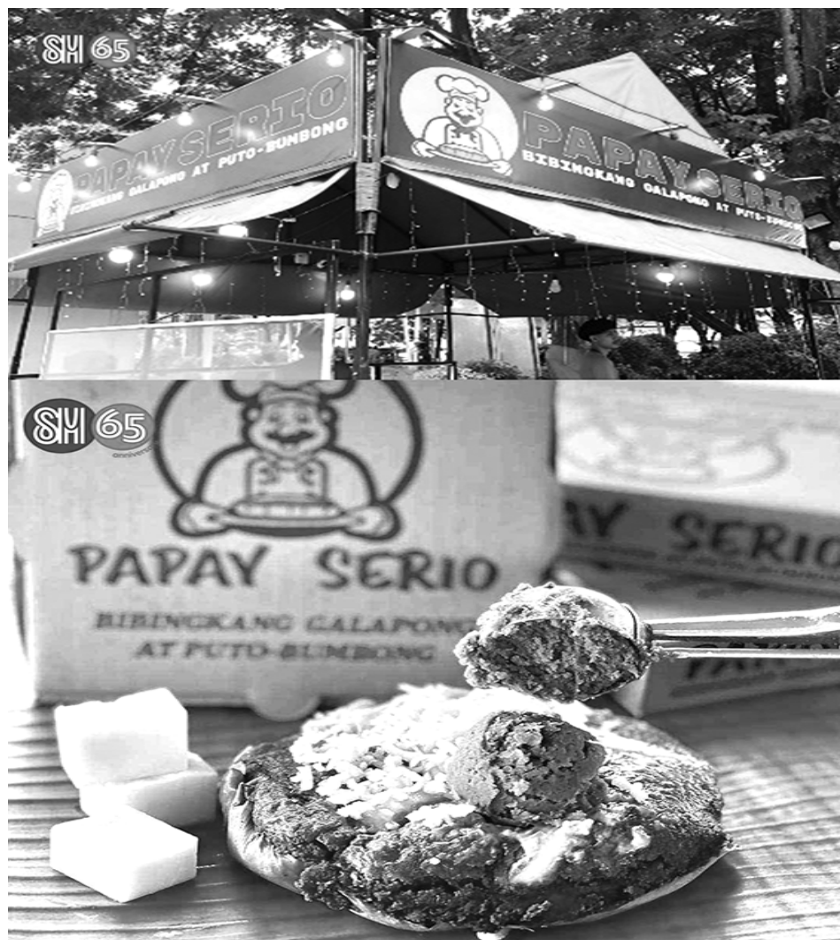
The home of the Best Bibingka Galapong and Puto Bumbong is now at SM City Trece Martires! Visit Papay Serio at SM City Trece Martires Transpot Hub and try their all-time favorite desserts and bring home the joys of Christmas to your loved ones today!

This initiative is aimed to address the Sustainable Development Goals 11 and 13 particularly indicator 11.5, which is, by 2030, significantly reduce the number of deaths and the number of people affected and substantially decrease the direct economic losses relative to the global gross domestic product caused by disasters, including water-related disasters, with a focus on protecting the poor and people in vulnerable situations. (Nova Belle C. Calotes/DOST10)