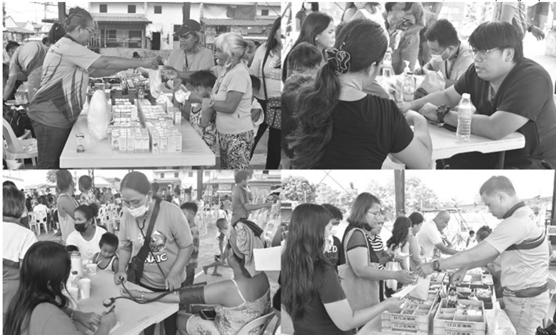
MEDICAL MISSION IN BARANGAY HALANG, NAIC: Residents of Barangay Halang, Naic, Cavite were the beneficiaries of the provincial government's Medical Mission Program held on September 12, 2023. The event was supervised by the medical mission team from the Office of the Provincial Governor, with the help of doctors and volunteers from the Office of Provincial Health Officer (OPHO). With an impressive turnout, the Medical Mission successfully accommodated a total of 509 patients, providing them with free consultations and necessary medications. The presence of dedicated doctors and volunteers from OPHO ensured that each patient received proper medical attention and care.