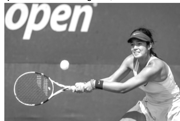
TOP-RANKED. A file photo of 2022 US Open Juniors singles champion Alex Eala. At No. 195, she is the highest ranked Filipino singles player in the Women's Tennis Association (WTA) rankings.

Eala, a graduate of the Rafael Nadal Academy in Mallorca (Spain), is currently at No. 192 in the Women's Tennis Association (WTA) singles rankings, a career-high after reaching the final of the USD25,000 event in Aldershot, Great Britain. She lost to Australian Destanee Aiava, 6-3, 4-6, 1-6.