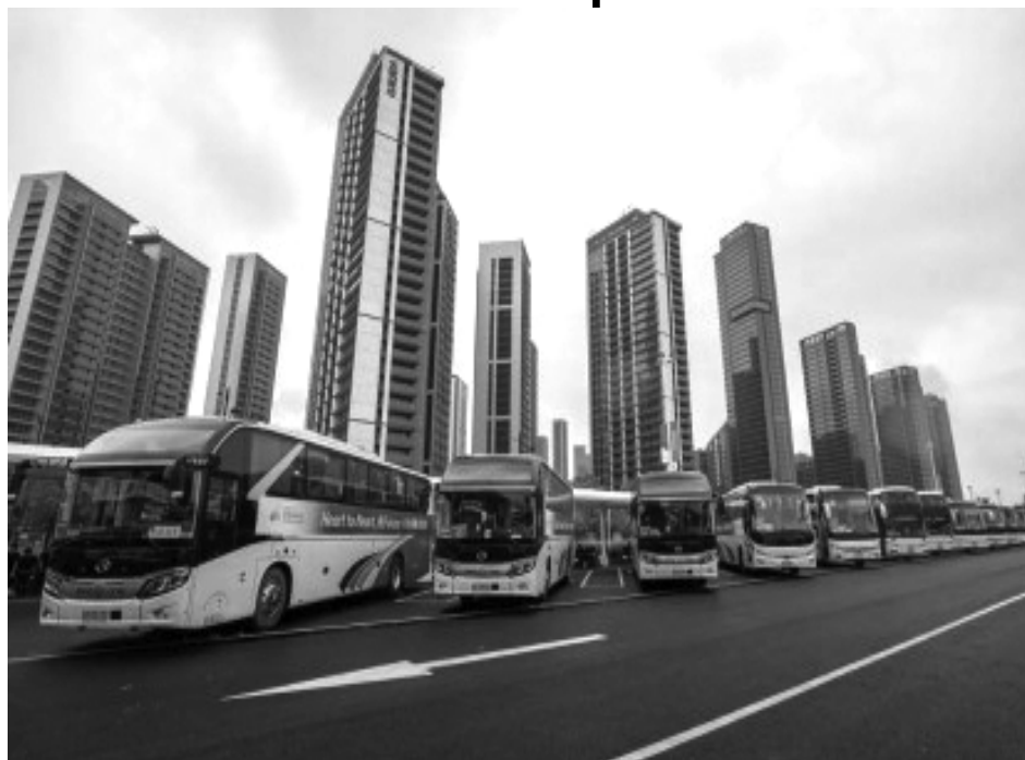
ALL SET. The media and technical officials village of the Asian Games started official operations Thursday (Sept. 14, 2023). The first group of journalists and technical officials arrived and completed check-in procedures.

Tolentino said the POC meets with HAGOC again on Sunday. (PNA)