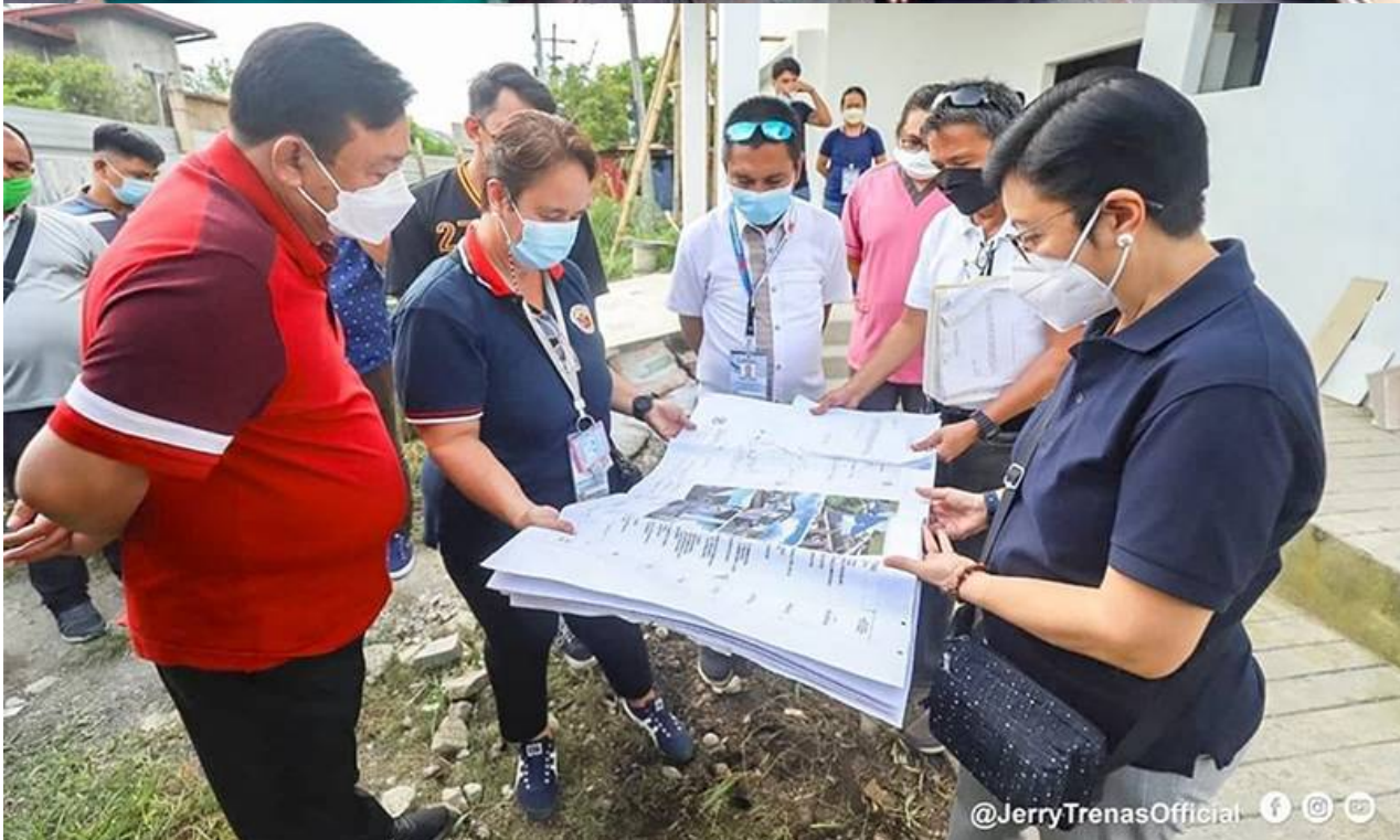
(Iloilo City's Mayor Jerry Treñas oversees a site inspection of the Uswag Dialysis Center in Barangay San Isidro to ensure it progresses smoothly, aiming to promptly offer free services to residents.)

Sa nakalipas na anim na taon, nakamit ng Iloilo City ang ilang mga pagkilala sa ilalim ng pamumuno ni Mayor Treñas, na nakatuon sa mga pagkilos na magtataguyod ng paglago ng ekonomiya, pagpapayabong ng kultura, at tuloy-tuloy na pagpapayaman ng ating kalikasan.