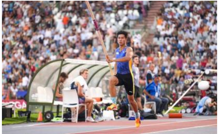
World No. 2 pole vaulter Ernest John Obiena