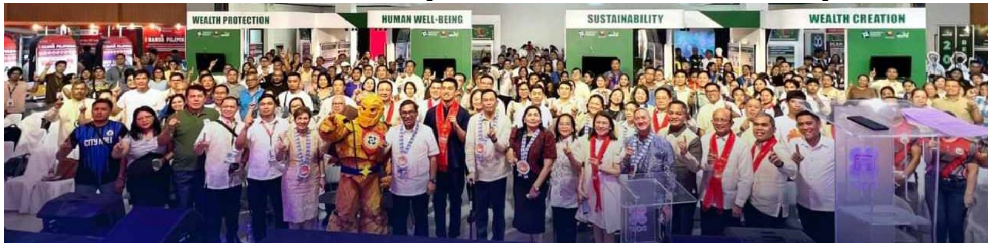
SCIENCE and Technology Secretary Renato U. Solidum Jr. has highlighted the advantage of transforming the Filipino context of resilience in building climate and disaster strategies to address the continuing threats of natural hazards.