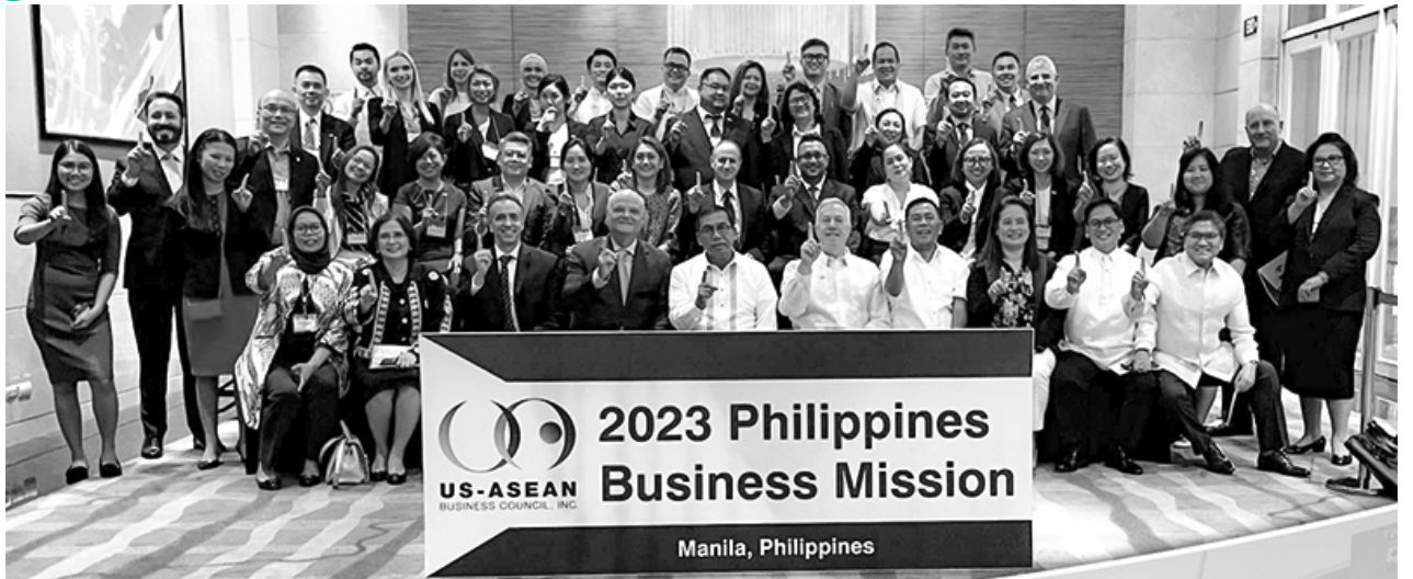
DOST officials, US-ABC executives, and member companies posed for a photo op at the close of the 2023 Philippine Business Mission