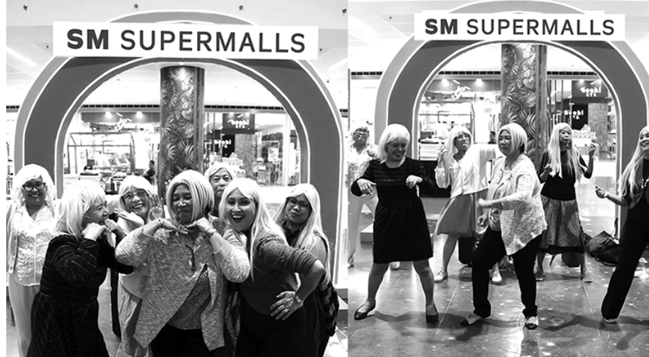
SM CITY MOLINO