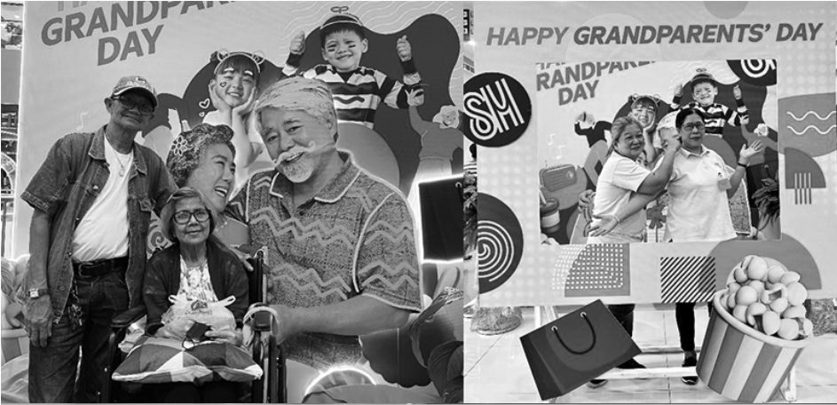
SM CITY MOLINO

SM Supermalls is rolling out the red carpet for the pillars of society that light up our lives. Yes, it's Grandparents Day at SM! And this year, the celebration is bigger, bolder, and bursting with more fun than ever before. Brace yourselves for a grand time with your lolos and lolas that promise unforgettable memories, heartfelt moments, and a whole lot of groove.