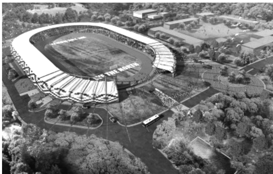
SPORTS DEVELOPMENT. The Ferdinand E. Marcos Sports Stadium in Laoag City, Ilocos Norte. Soon, a sports academy is expected to rise near the stadium to develop home-grown athletes.