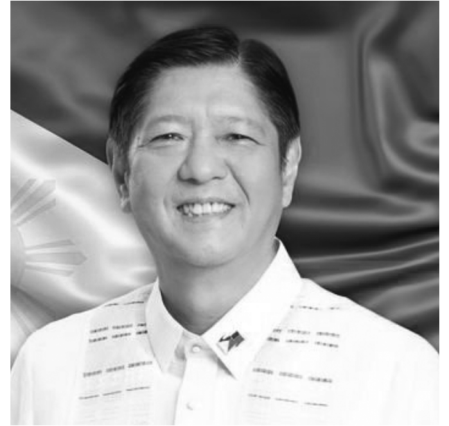
President Bongbong Marcos

Marcos warned that as tensions and mistrust between the great powers escalate, so does the prospect of miscalculation that could threaten to engulf the region, with severe consequences for all. (PND)