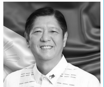
President Bongbong Marcos

Upholding ASEAN Centrality, Marcos said the Strategy seeks to promote peace, resilience, and security; expand trade, investment, and supply chain resilience; invest in and connect people; build a sustainable and green ► PBBM CITES • 4