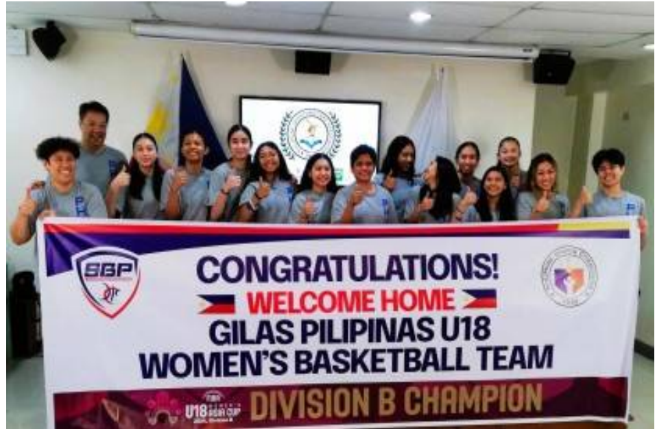
The Gilas Pilipinas U18 team

"I hope that someday they can all represent the senior team. They have talents, they can do more. And hopefully, we'll find new faces who will continue with our program. We have a big pool now. It's getting bigger." (PNA)