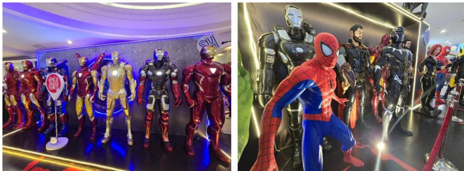
A stunning display of superhero suits are exclusively displayed at the Toy Fezt 2.0. This collection will be travelling at SM Malls in South Luzon until 2025.