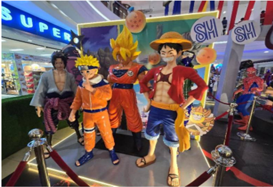
These anime classics from your favorite Japanese cartoons are also showcased at the exhibit.

This exhibit will continue to travel from SM City Bacoor to all SM malls in South Luzon until 2025. Next stop is SM City Sta.Rosa, so watch out! Don't miss out on this unique opportunity to immerse yourself in the world of action figures and collectibles. Be part of the excitement and celebrate your favorite characters at Toy Fezt 2.0!