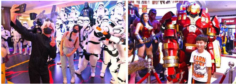
Fans immerse themselves in the excitement as they pose iconic movie characters.

Excitement reached a fever pitch as toy collectors gathered at SM City Bacoor for the highly anticipated launch of Toy Fezt 2.0. From June 8 to 22, the mall's Event Center transformed into a spectacular showcase from two esteemed artists famous for their fan-made, life-sized, and larger-than-life action figures, offering shoppers an exclusive and exhilarating experience.