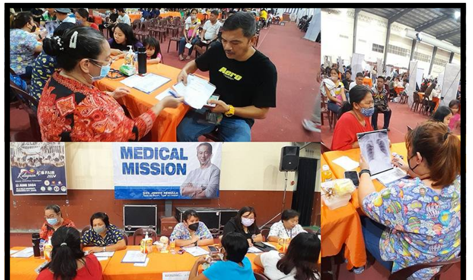
Medical mission in DLSU-D benefits hundreds: In celebration of Independence Day, the Provincial Government of Cavite in collaboration with the Department of Labor and Employment (DOLE- IVA) conducted the medical mission at Ugnayang La Salle in De La Salle University - Dasmariñas (DLSU-D) on June 12, 2024. The event brought vital health services to over 200 beneficiaries, emphasizing the importance of accessible healthcare for the community. The mission offered a range of services including electrocardiogram (ECG), X-ray, medical check-ups, and free prescription medications. These services were instrumental in addressing various health concerns and providing necessary medical support to attendees. The event was a collaborative effort, showcasing the spirit of unity and service that Independence Day symbolizes. Through this initiative, the community not only celebrated freedom but also received the gift of health, ensuring a brighter future for Caviteños.