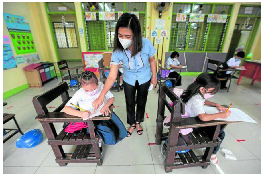
A teacher and her students learn together at the Pedro Cruz Elementary School in San Juan City as it reopened its face-to-face classes.

The appointments for the Teacher Education Council (TEC) Secretariat will be completed in due time, the Department of Education (DepEd) said on Wednesday.