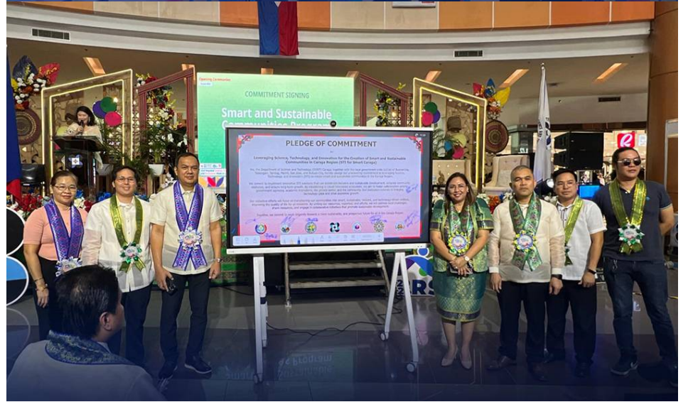
reinforces the collective dedication to craft a resilient and prosperous future for the Caraga region through collaborative endeavors and forward-thinking solutions. (Nelson Santos)