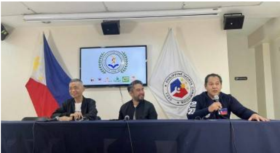
YOUTH SPORTS. Perlas ng Silangan Basketball League officials grace the Philippine Sportswriters Association (PSA) Forum at the Rizal Memorial Sports Complex on Tuesday (June 11, 2024). The league will kick off on July 24 at the Smart Araneta Coliseum.

The Perlas ng Silangan Basketball League, which is purely a development tournament, will kick off on July 24 at the Smart Araneta Coliseum in Quezon City.