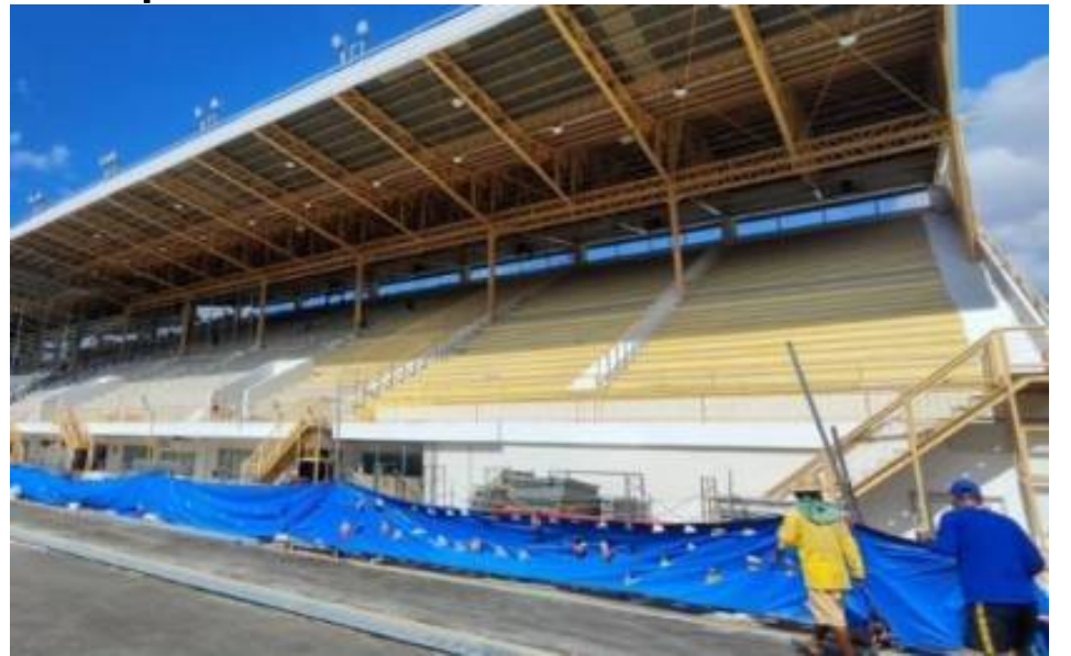
READY. The Cebu City Sports Center grandstand undergoes massive makeover in preparation for the Palarong Pambansa slated July 6 to 17, 2024. Cebu City Acting Mayor Raymond Alvin Garcia on Tuesday (May 21) said the Metro Cebu tri-cities of Cebu, Mandaue, and Lapu-Lapu will work hand-in-hand to promote sports tourism in anticipation of the more than 20,000 delegates from different provinces.

Among the events in the Palaro are archery, arnis, athletics, badminton, baseball, basketball (5x5 and 3x3), billiards, boxing, chess, dancesports, football, futsal, gymnastics, pencak silat, sepak takraw, softball, swimming, table tennis, taekwondo, lawn tennis, volleyball, wrestling and wushu. (PNA)