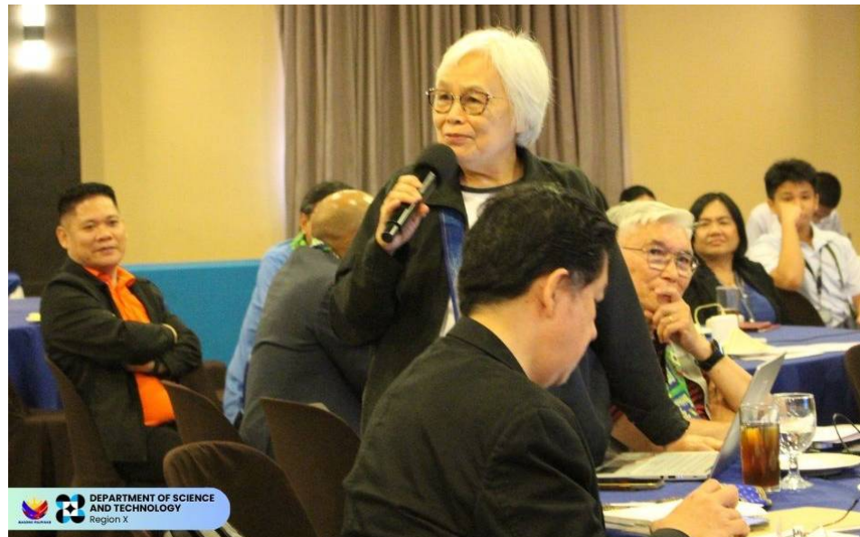
DEPARTMENT OF SCIENCE AND TECHNOLOGY Region 10