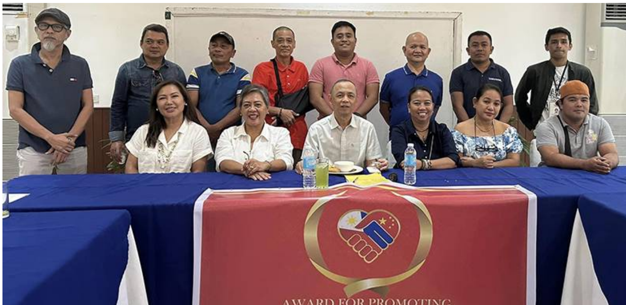
The Association for Philippines-China Understanding (APCU) holds a Press Briefing for members of the Cebu City Media May 16 on its project the Awards for Promoting Philippines-China Understanding (APPCU), now on its 4th year giving recognition to Filipinos with outstanding work in building friendship between the two nations.