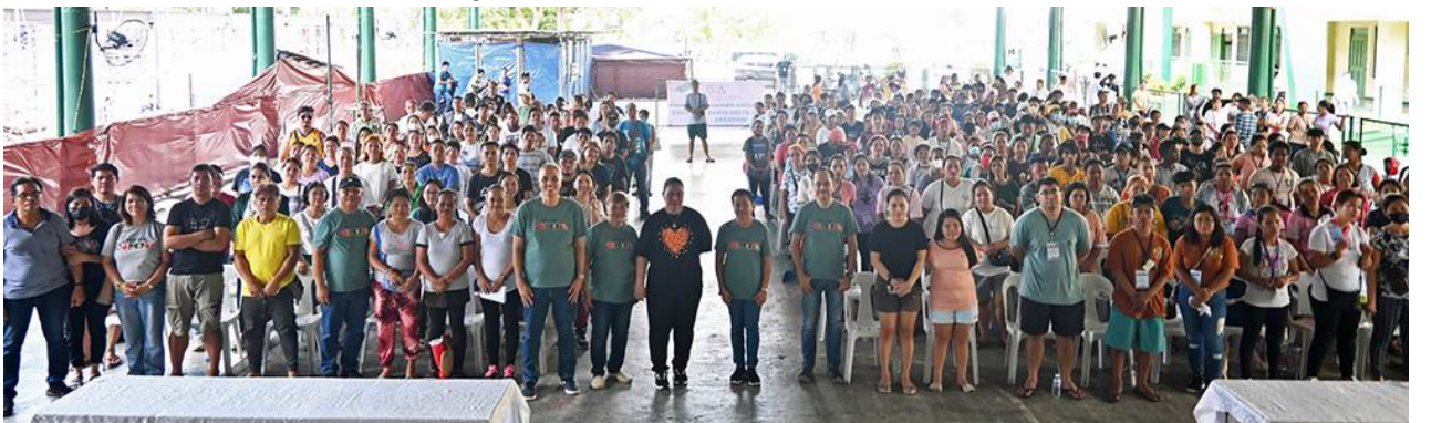
TUPAD ORIENTATION PARA SA 253 BENEFICIARIES NG CITY OF CARMONA: Binisita po natin ngayong araw ang isinagawang Orientation at Contract & DTR Signing ng 253 na beneficiaries ng Tulong Panghanapbuhay sa ating Disadvantaged/Displaced Workers (TUPAD) na pawang mga taga-City of Carmona. Ito ay sa pangunguna ng Office of the City Public Employment Service Manager at sa pakikipagtulungan ng partnership with Department of Labor and Employment (DOLE) - Cavite. Ang mga nasabing beneficiaries ay sasailalim sa 10-Day Community Clean-Up sa ating lungsod bilang community service. Nawa ay makatulong po ang programang ito sa inyong pang-araw araw na pamumuhay. #DOLETUPAD #TUPAD #CityOfCarmona #LungsodNgCarmona #LGUCarmona #BayanMunaLagi #DapatAngatLahat