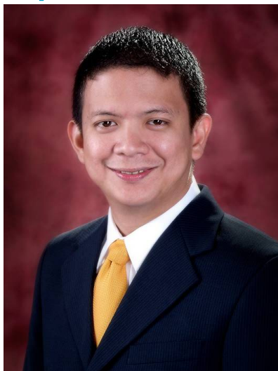
► APCU LAUDS • 5

APCU further agrees with Senator Escudero that these issues do not "justify the racial slurs against Chinese students" in Tuguegarao, Cagayan or to any other foreign students and foreign nationals in the country.