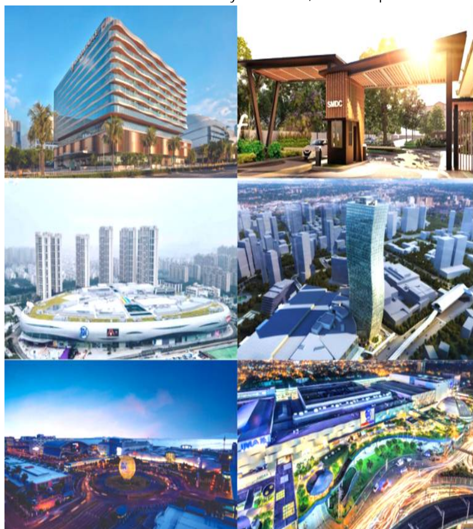
From Left to Right, Top to Bottom: Lanson Place, SM Development Corporation (SMDC) Turf Residences, SM City Yangzhou in China, SM Mega Tower, SM Mall of Asia Complex, and SM City North EDSA

For now, what is best for the country is to continue our good relations and friendship with China, to resolve whatever differences through peaceful dialogue and cooperation, and to stop Sinophobia.