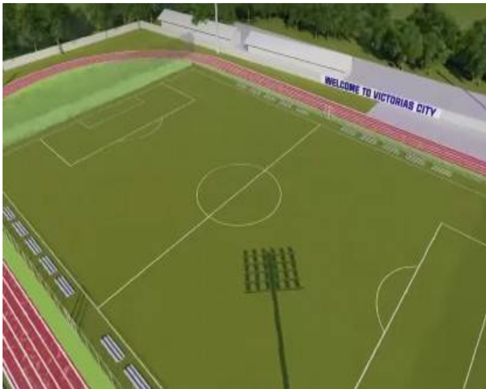
FOOTBALL PITCH. A design perspective of the artificial-grass football field that will soon rise at the Victorias National High School campus in Victorias City, Negros Occidental. It will be the first 11-a-side synthetic turf soccer pitch to rise in Western Visayas.

BACOLOD CITY – The City of Victorias in Negros Occidental is constructing a more than PHP50-million artificial grass football pitch in the Victorias National High School campus, the first ever in Western Visayas.