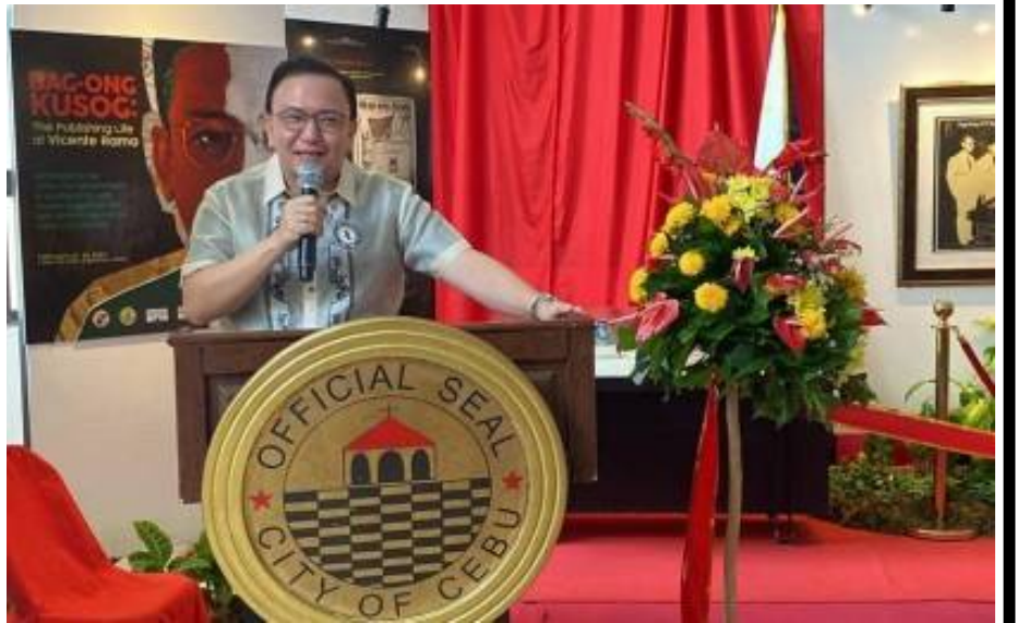
Cebu City Vice Mayor Raymond Alvin Garcia.

CEBU CITY – Vice Mayor Raymond Alvin Garcia on Tuesday assured the 12,000 delegates for the Central Visayas Regional Athletic Association (CVRAA) 2024 of their health and safety amid the intensifying heat brought by the El Niño phenomenon.