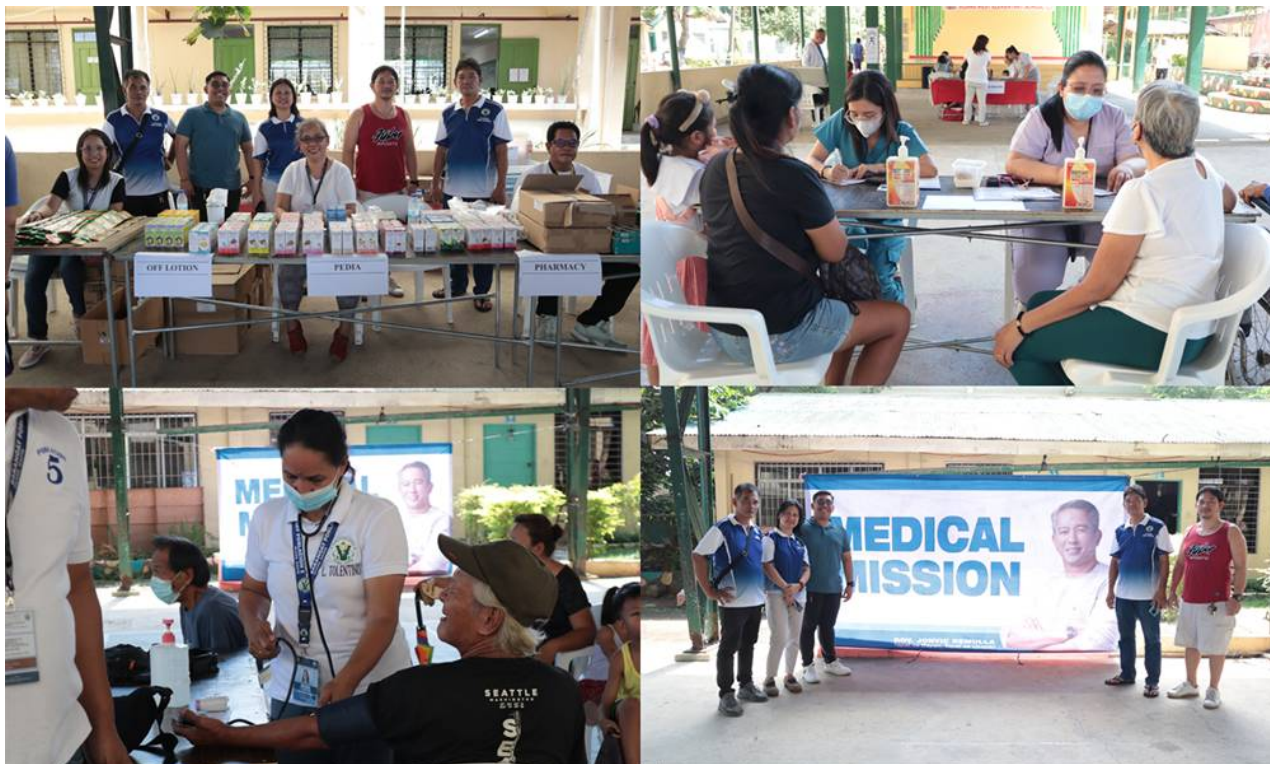
Breaking barriers to healthcare. The Office of the Provincial Governor - Medical Mission Team, joined by the Office of the Provincial Health Officer, spearheaded a transformative medical mission program on April 24, 2024, in Barangay Poblacion V, Silang, Cavite. Offering free medical check-ups and vital medicines, the health outreach event proudly served 280 patients, ensuring no one is left behind in the pursuit of a healthier, happier community.