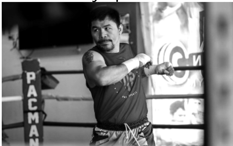
Former eight-division world champion Manny Pacquiao