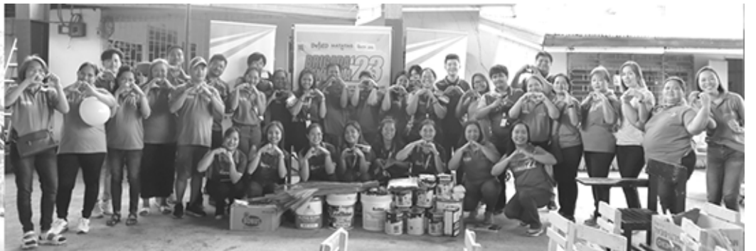
MPT South Volunteers pose with school officials and other community volunteers during Brigada Eskwela at Tibig Elementary School, Silang, Cavite (L) and Gahak-Marulas Elementary School, Kawit, Cavite (r).

leading mobility infrastructure at solution provider sa bansa. Ito ang toll road development arm ng Metro Pacific Investments Corporation (MPIC).