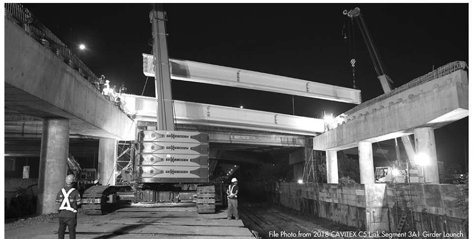
Actual photo of girder launching activity for CAVITEX C5 Link last 2018 over SLEX. Similar activity will be done at CAVITEX Parañaque (near Toll Plaza) for CAVITEX C5 Link R1 Interchange construction. During the girder launching activity starting September 15 to 24, 2023, counterflow lane will be activated for all vehicle classes.