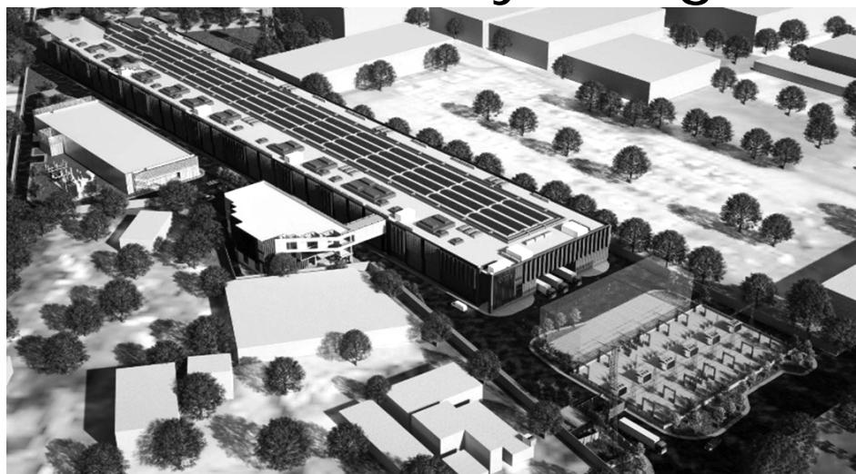
Photo of soon-to-rise ePLDT VITRO Data Center

This partnership also steps up Eastern Communications' operational capacity in disaster recovery by adding a redundancy system for its data services. By acquiring colocation slots with