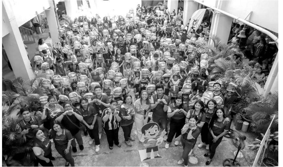
Students of Col. E. De Leon Elementary School in Paranaque received free school supplies to kick off this year's Brigada Eskwela.