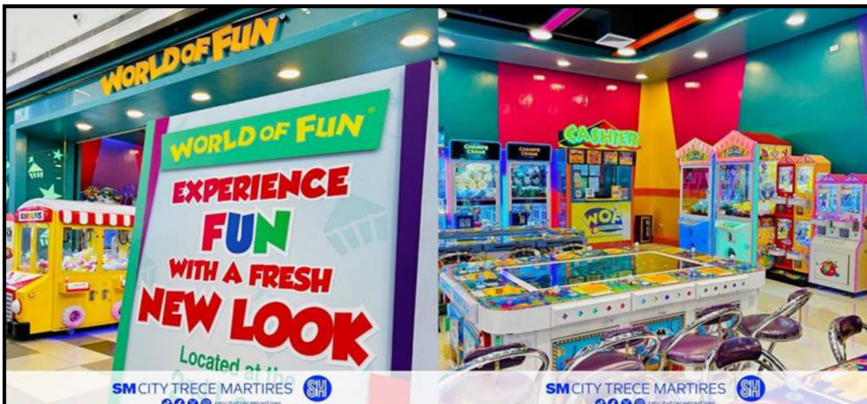
More fun in the World of Fun SM City Trece Martires: The fun never stops at SM City Trece Martires with the opening of the World of Fun. Create beautiful memories with your family and spend time with them at World of Fun! World of Fun is now open at Level 2, SM City Trece Martires!