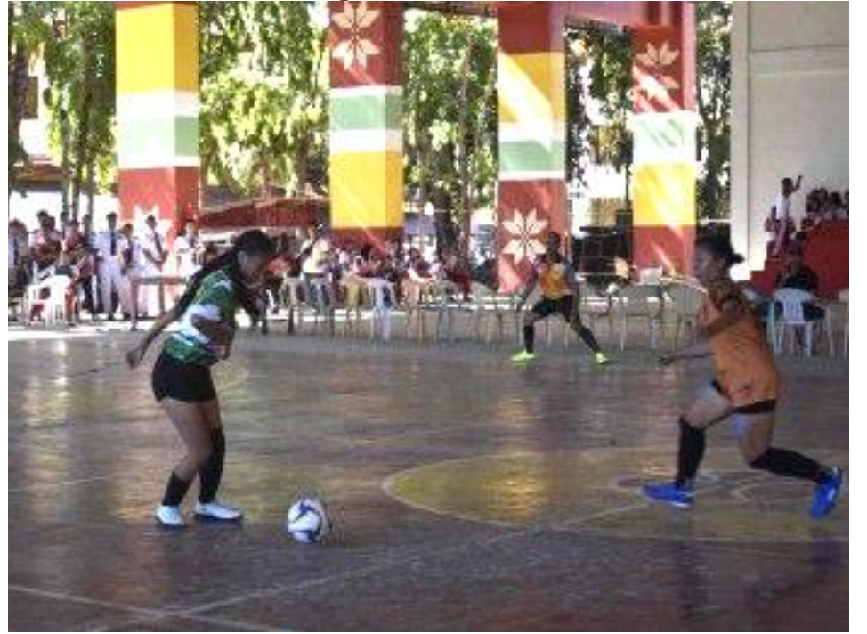
REGIONAL MEET. Athletes compete during the Antique Provincial Athletic Association Meet on April 3, 2024. Antique Governor Rhodora J. Cadio said in an interview Monday (April 15, 2024) that the provincial government will send a strong athletic delegation to the Western Visayas Regional Athletic Association (WVRAA) Meet in Negros Occidental on May 2-7, 2024.

The Antique provincial government has allocated PHP16.09 million for the more or less 555 athletes and coaches to the regional sports meet. (PNA)