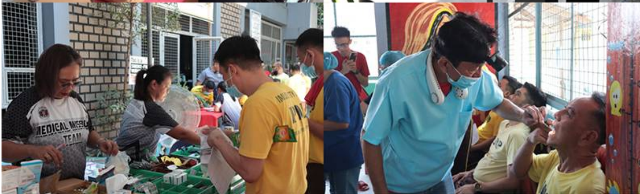
On April 11, 2024, the Office of the Provincial Governor - Medical Mission Team, in partnership with the Office of the Provincial Health Officer, orchestrated a medical and dental mission at BJMP in the City of Imus. The primary objective of the event was to cater to the healthcare needs of the PDL (Persons Deprived of Liberty) community by offering vital medical and dental services. A highlight of the mission was the inclusion of the Lab For All Truck, which provided ECG services for 12 patients, free X-ray examinations for 15 individuals, and offered free tooth extraction services benefiting 50 patients. Expanding its scope, the mission also provided free check-ups and medicines for 293 individuals. These services addressed a spectrum of health issues and garnered appreciation from the community.