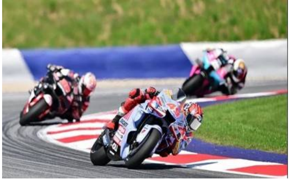
Red Bull Ring in Spielberg, Austria on Aug. 20, 2023