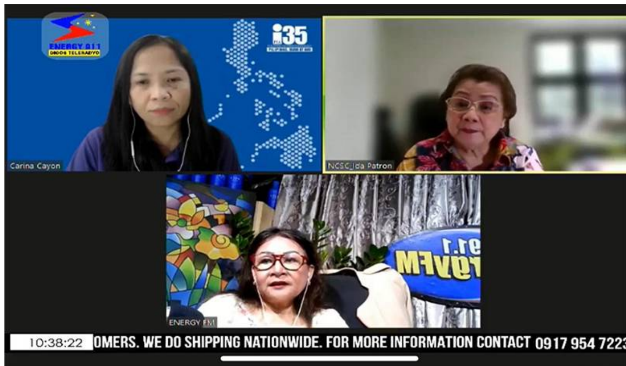
NCSC Commissioner Ida Yap-Patron discusses Republic Act 11350, or the National Commission of Senior Citizens (NCSC) Act, and its programs to promote the welfare of the Filipino senior citizens.

The National Commission of Senior Citizens (NCSC) is designing several programs that center on promoting the dignity, security, and well-being of elders in the country.