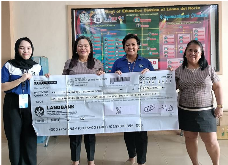
Official Turnover of 21st CLEM to LNNCHS photo op.

Previously, over 38 public schools in the province benefited from the DOST's Science and Technology Academic and Research-based Openly Operated Kiosks (STARBOOKS). STARBOOKS is a digitized library which provides S&T information even without the use of the Internet.