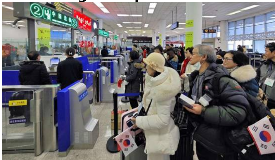
South Korean tourists go through border inspection in Yantai, east China's Shandong province.

Since 2023, the NIA has been providing convenience for foreign nationals through port visas and multiple-entry visas issued within the country. It has gradually restored passenger clearance at waterway ports, fully resumed exit and entry of international cruise passengers, reinstated visa-free transit policies and expanded their application to more countries, and provided convenient services for talent attraction. These