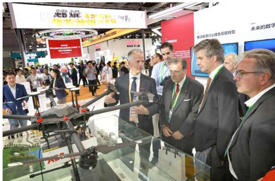
Foreign exhibits visit the technology equipment exhibition area at the sixth China International Import Expo.

Every day when the land port of Hong Kong-Zhuhai-Macao Bridge opens, a vibrant and bustling scene is on - tourists from the Chinese mainland conversing in different local dialects and Hong Kong and Macao families embarking on trips to the mainland are coming and going. Such lively atmosphere can be observed at various other ports across China, too.