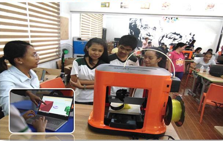
Science Education Institute Department of Science and Technology

3D Modelling & Printing that will be available in the 21st CLEM Facility