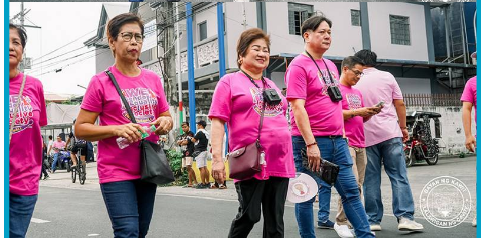
The municipality marched in unison with the local government's Sulong Kababaihan Women's Walk 2024 held this March 15. In its second year, women and civic organizations, supporters of Reyna ng Tahanan 2024 representatives, and local government staff paraded from Brgy. Panamitan to Aguinaldo Shrine. #AlagangAngeloAguinaldo #WeCanBeEquALL #SulongKababaihan2024 #ReynaNgTahanan2024 #RatedTripleA #PusoAtMalasakitParaSaAtingKawit