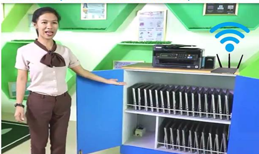
Science Education Institute Department of Science and Technology

Laptops, Wireless Printer, & Wi-Fi that will be available in the 21st CLEM facility