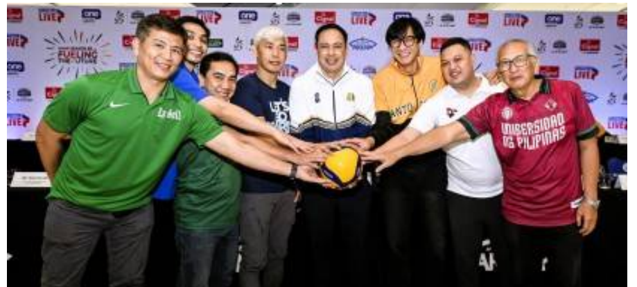
UAAP VOLLEYBALL. Coaches of the men's teams pose during the University Athletic Association of the Philippines (UAAP) Season 86 collegiate volleyball press conference at the Coral Way Lobby of the SM Mall of Asia Arena in Pasay City on Monday (Feb. 12, 2024.) UAAP Season 86 collegiate volleyball tournament will start on Feb. 17.

The National University (NU) and De La Salle University (DLSU) are both determined to keep their respective titles in the University Athletic Association of the Philippines (UAAP) Season 86 collegiate volleyball tournament which will start on Feb. 17 at the SM Mall of Asia Arena.