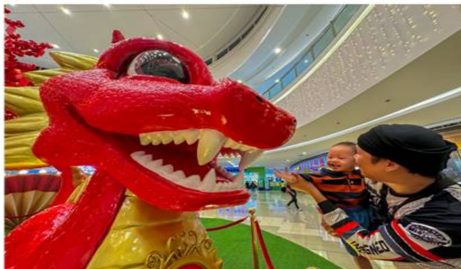
SM CITY BACOOR, SM CITY MOLINO, AND SM CENTER IMUS, CAVITE - SM City Bacoor, SM City Molino, and SM Center Imus are ushering in the Chinese New Year with a captivating celebration, embracing the Year of the Dragon with a dazzling display at their event centers. Shoppers are treated to a spectacular scene featuring a breathing dragon and a grand prosperity tree, symbolizing good fortune and abundance. SM City Bacoor stands out with its golden prosperity tree, adding an extra touch of lavishness to the festivities. The vibrant atmosphere and intricate decorations create a joyous ambiance, providing a delightful experience for visitors as they immerse themselves in the spirit of the Lunar New Year at these SM malls in Cavite.