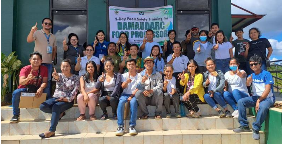
THE Dept. of Science and Technology (DOST) upskills employees of a dairy cooperative in Malaybalay City, Bukidnon.

This is with Food Safety Training and various science and technology interventions. Members of the Dalwangan Malaybalay United Dairy Agrarian Reform Cooperative (DAMAUDARC) now adopt the Good Manufacturing Practices (GMP) in the daily production of cow's milk.